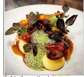
Chef Guillaume Chambon

Red Wine Vinegar, Tomato Vinegar Acetic Acid 5% Optimal Storage 12°C/55°F 45% Humidity Product of Canada