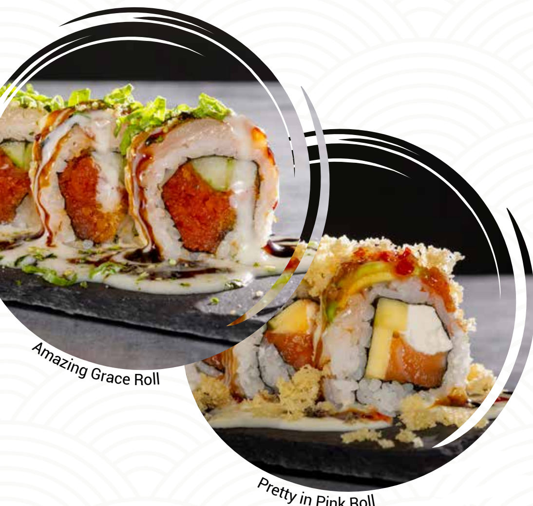
Amazing Grace Roll