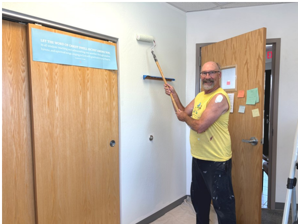
PASTOR’S OFFICE IS GETTING A MAKE-OVER!

Rather than donating online, you can set up “bill pay” through your bank. Most banks have this service. You save yourself and the church the “transaction fee”. We have a number of folks who contribute this way. Checks generally take a week to get through the mail. See pastor or contact your bank for more information.