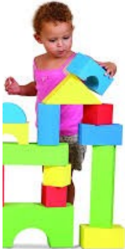
Large Foam Blocks

Have children build an apple tree as they complete directives. Ideas of what materials can be used pictured below: