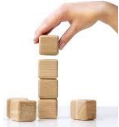
Small 1-inch cubes