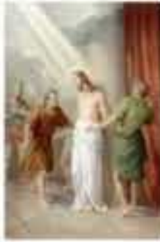
THE SCOURGING AT THE PILLAR