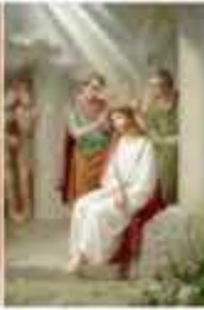
THE CROWNING WITH THORNS