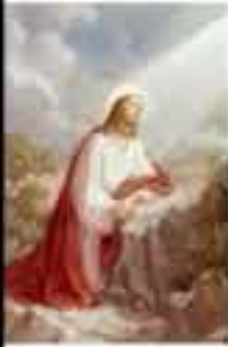
THE AGONY IN THE GARDEN