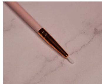
THE THIN EYELINER

Use with gel or liquid eyeliner to create the perfect wing. The small angled shape allows for extra control along the lash line. Can also be used with gel or cream products to line and define eyebrows by creating thin hair strokes.