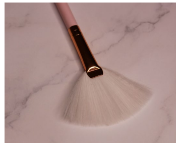
THE FAN HIGHLIGHTER

Use for both powder contour, blusher or bronzer application.