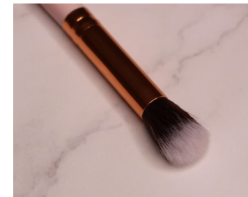
THE "BIG FLUFFY" EYESHADOW BLENDER

Use to apply and blend liquid or cream concealer. The soft duo fibre bristles help to buff product and create a smooth finish under the eyes. Can also be used to apply any colour correcting products.