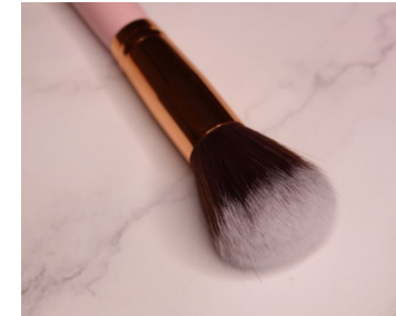
THE LARGE POWDER

Use to apply setting powder on small areas of the face including under eyes, around the nose, forehead and chin. Designed to "set" and hold foundation in place, preventing makeup from rubbing off and reducing shine for a long-lasting, flawless finish.