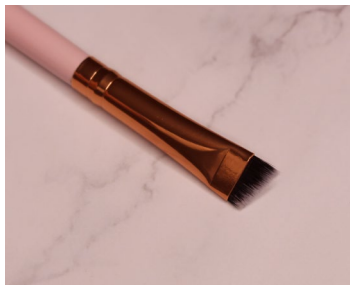
THE MEDIUM ANGLE

Use to apply highlight on the inner corner of the eyes and brow bone. Can also be used with a dark eyeshadow to deepen the outer corners of the eyes when creating a more glamorous eye look.