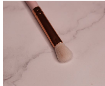
THE "BABY FLUFFY" EYESHADOW BLENDER

Use to apply and blend eyeshadow in the crease, suitable for a smaller or hooded eye shape. Can also be used to add shade to the outer corners of the eyes and fade colours into crease.