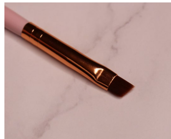
THE SMALL ANGLE

Use to smudge eyeshadow underneath and define lower lash line or smudge eyeliner on the top lash line. Can also be used to shape and fill in eyebrows with any powder product.