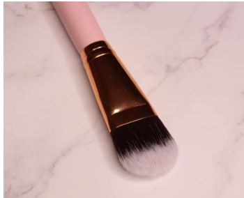
THE FLAT FOUNDATION

Use to apply cream or liquid foundation, primers, tinted moisturisers or BB Creams. Best for achieving a medium to full coverage.