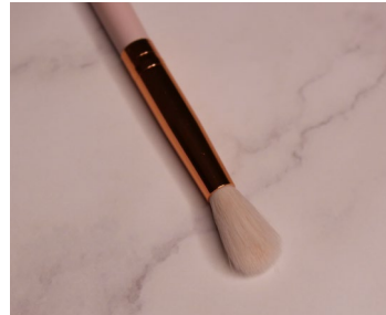
THE "MEDIUM FLUFFY" EYESHADOW BLENDER

Use to apply any powder or cream eyeshadow on the eyelid. Best used with any shimmery, sparkly or glitter pigment eyeshadows.