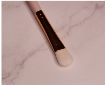
THE FLAT EYESHADOW APPLICATOR

Use to apply any powder or cream eyeshadow on the eyelid. Best used with any shimmery, sparkly or glitter pigment eyeshadows.