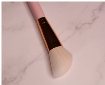
THE SLANTED CONTOUR & BLUSH

Use to dust a fine layer of setting powder all over the face. Can also be used to brush away any eyeshadow fallout or blend away harsh lines of contour or blush.