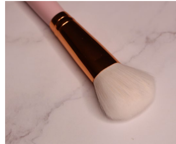
THE SMALL POWDER

Use to blend cream or liquid foundation, tinted moisturisers or BB creams. The flat bristles make it easier to buff product into the skin creating an airbrushed and flawless finish. Can also be used to blend cream or liquid contour.