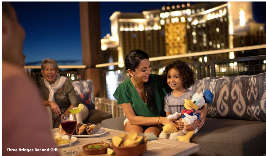
Three Bridges Bar and Grill

Savor espresso drinks, pastries and light fare, as well as cocktails, Spanish and California wines and American craft beers at this hybrid bakery-bar inspired by Spain's coffee and gin culture.