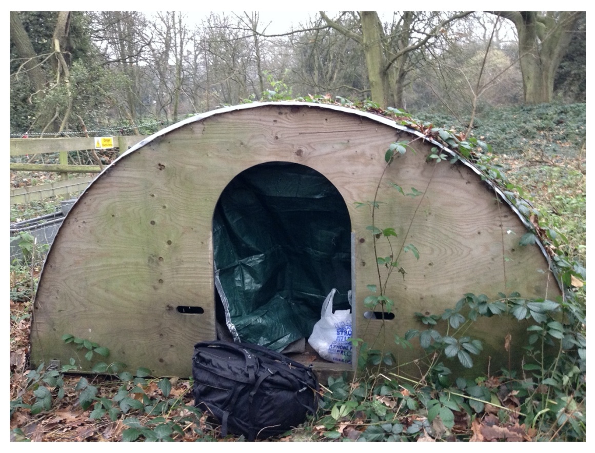
THE PIG ARC WITH FLOOR IN A LONDON PARK