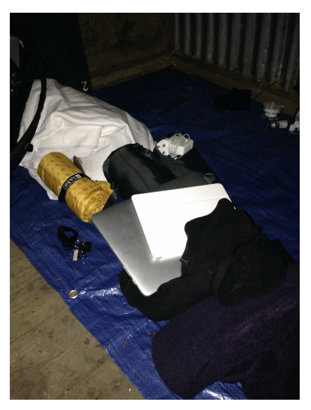
INSIDE THE PIG ARK