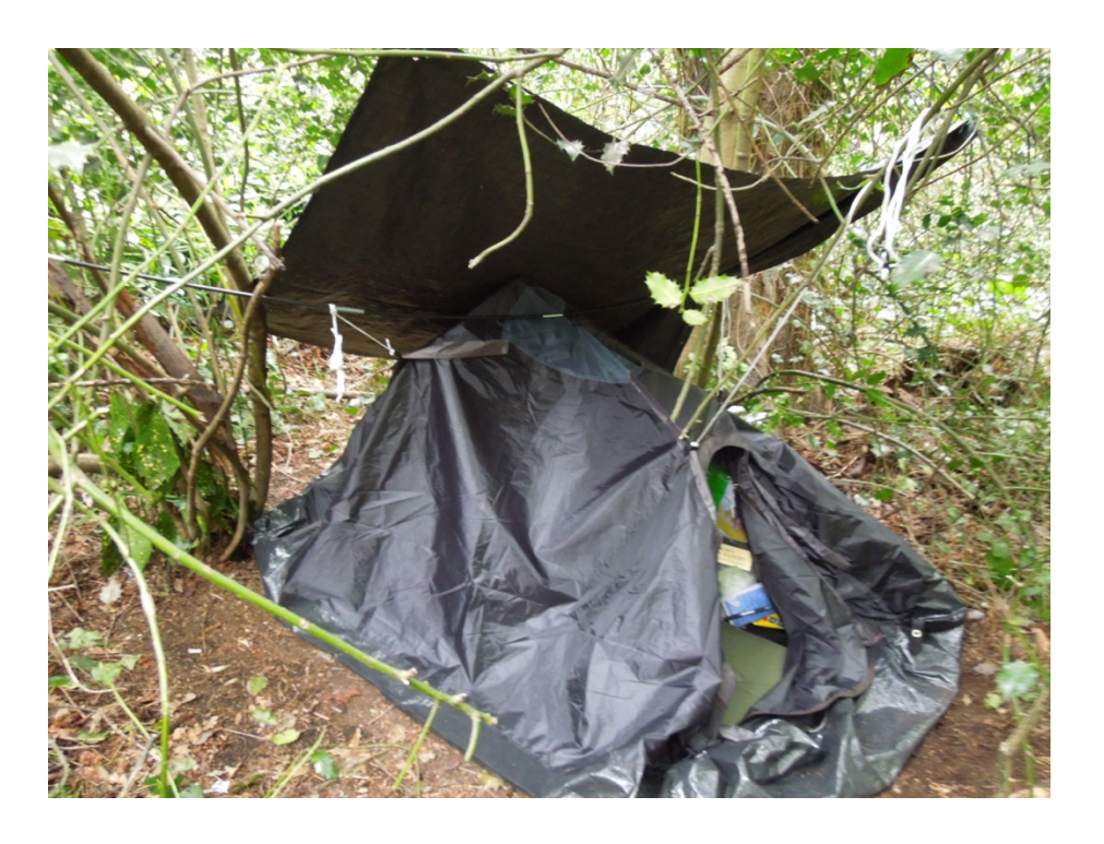
IN CARCASSONNE I ALSO SLEPT IN THE WOODS UP A HILLSIDE

Around 2006, I had started writing songs and posted them up on the internet site Myspace hoping to attract a composer for my lyrics. In 2010 I discovered that many songs had been stolen and three different artists had recorded my songs. Two songs enabled two different singers claiming to be singer-songwriters, to win prestigious awards one valued at about £8,500.