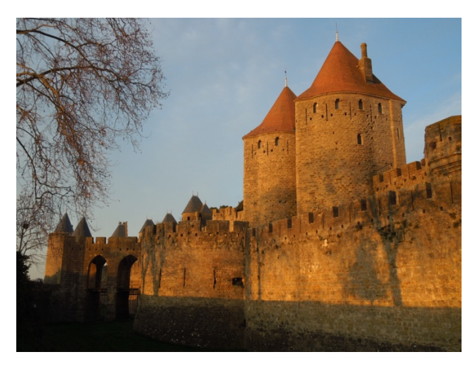
THE CASTLE IN CARCASSONNE NEAR TOULOUSE

When my small monthly pension came through, I sometimes used to travel by Megabus to Birmingham to stay in a hostel to get some sleep, wash and cook. I did a brief trip to Carcassonne in the south of France, where I discovered a magnificent castle and took a train to Venice to take advantage of the warmer weather, as I had been in London during the winter. Megabus was great because it was so clean and cheap.