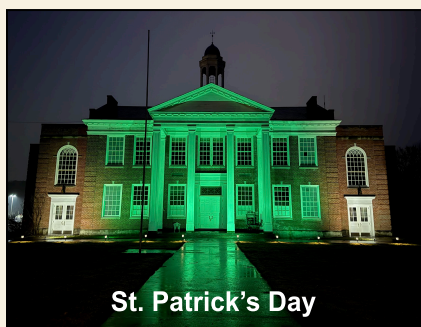
St. Patrick's Day