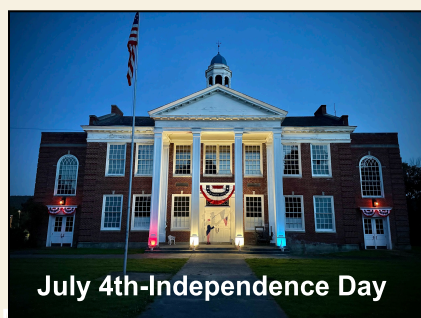
July 4th-Independence Day