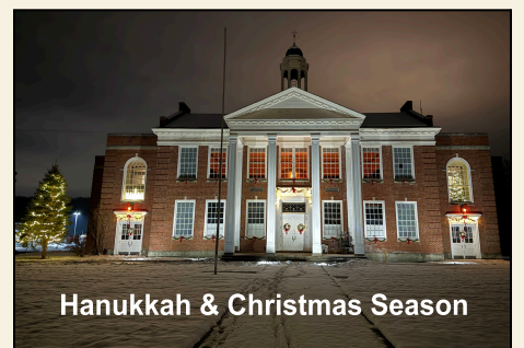
Hanukkah & Christmas Season