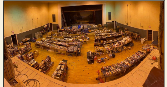
Rummage/book sale (before new lighting and paint).

NVHS took ownership of the building in early 2023. Our first year focused on cleaning, organizing, and preparing the space for community use. We held a large rummage sale, several book sales, and a few small events to reintroduce the building to the community. In spring 2024, major upgrades took place—most notably, replacing all lights with energy-efficient LEDs and giving the gym a much-needed refresh with new paint and repairs.