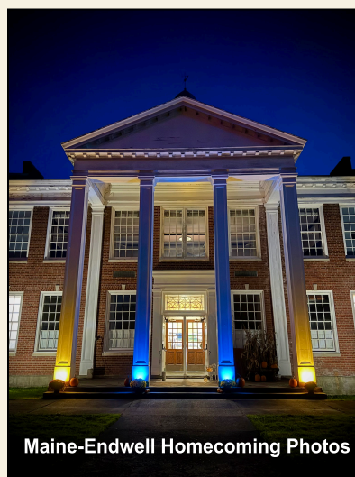
Maine-Endwell Homecoming Photos