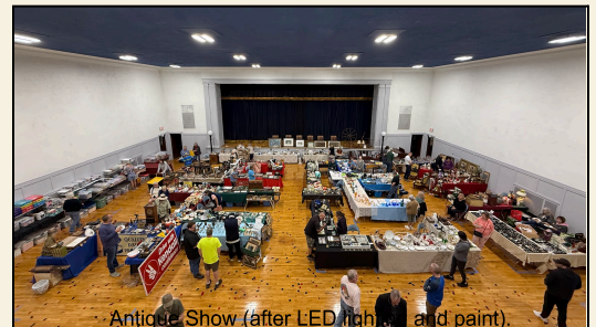
Antique Show (after LED lighting and paint).