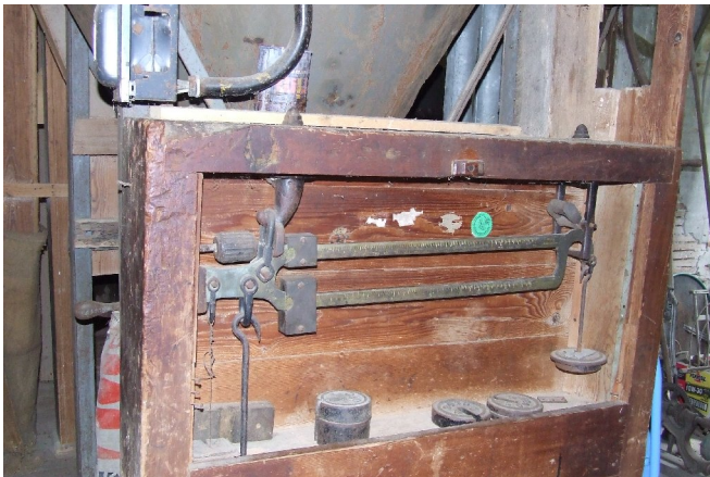
Scales at the Mill

We Haz Jazz, and on September 20, 2009 the Maine fall musical will take place at the Maine Memorial School auditorium. Watch for more information.