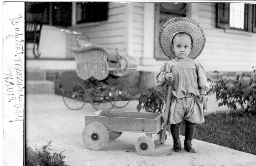
Baptist minister's boy in Maine 1908.