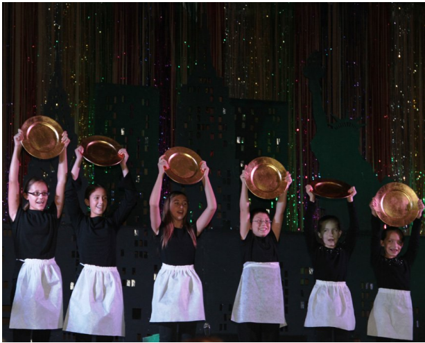
Be Our Guests Kids