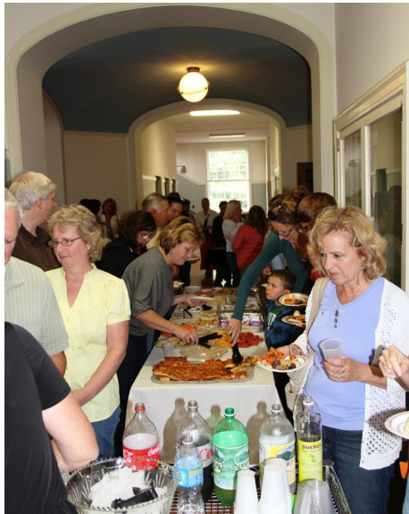
Desserts in the Hall