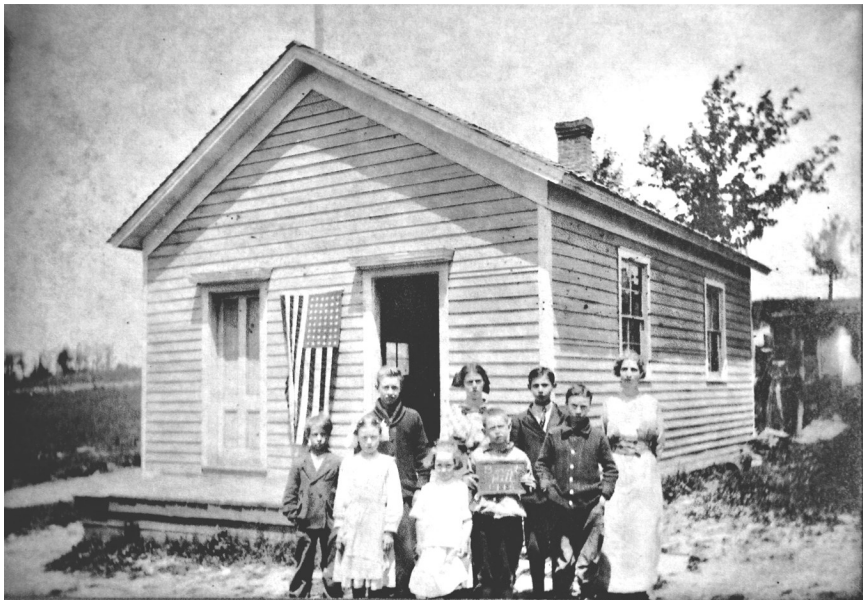
Schoolhouse No. 4 ca. 1915