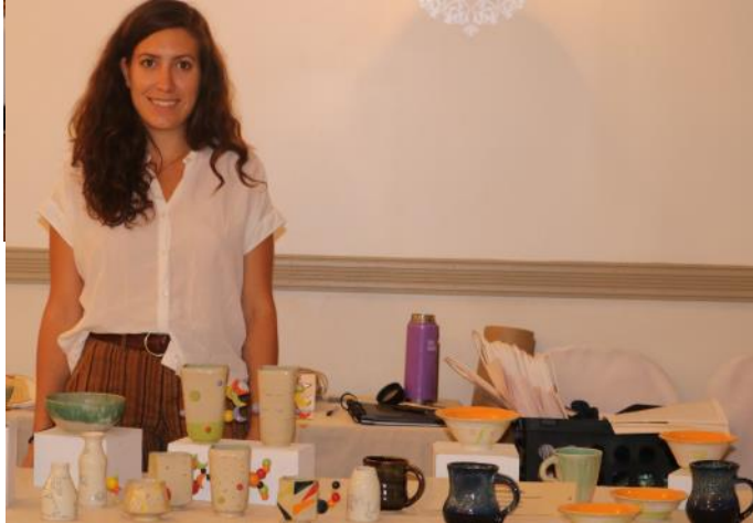
Artisan Crafts at the Maine Event and around town