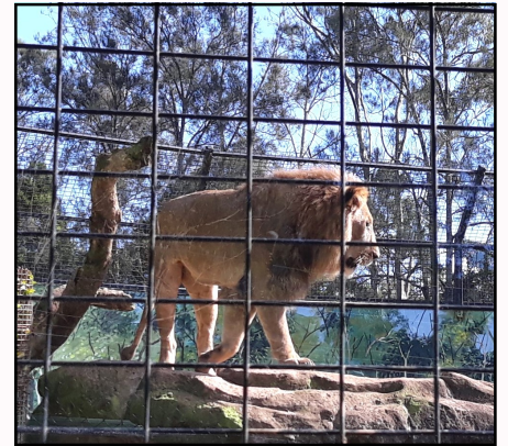
Billabong Zoo .. Thurs 26 May

Not everyone was able to make it and some who'd been away from class didn't know it was on. We'll arrange another outing before too long. We're all so busy on our 'days off' dancing. It's impossible to find a day to suit everyone.