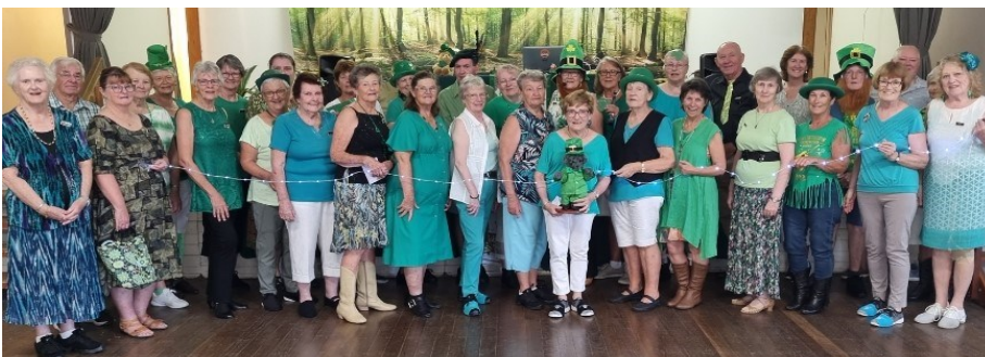
Our very green St Patrick's Day social.

Finally, a heads up that in future we'll have school & public holidays off .