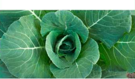
Greens Collard, Mustard, Turnip