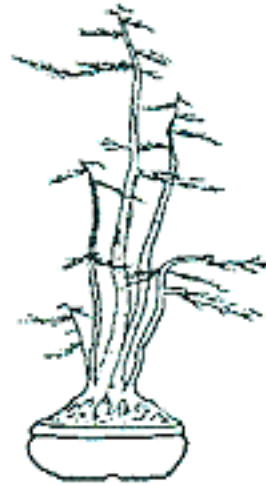
Literati Group or Clump Style