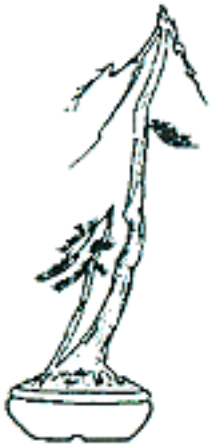
Literati Twin Trunk

may want to tie them in place. Second, foliage should be kept relatively sparse. The general elegance of literati design prohibits heavy top foliage on a slender trunk with little taper.