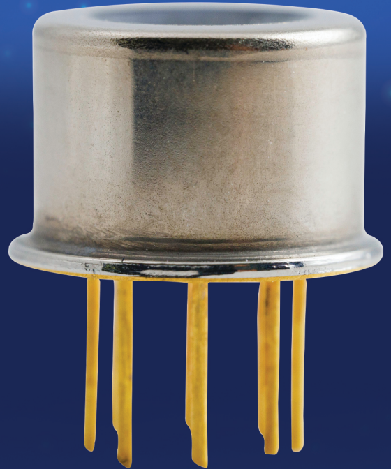
TO-Can Packaged TE-Cooled InGaAsP SPAD Detector