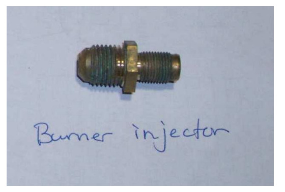
NG ACA-A2668 LP ACA-A2302