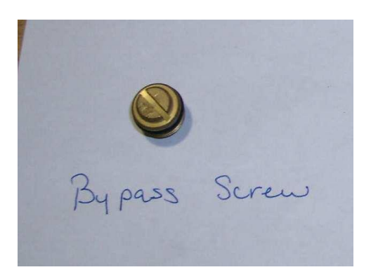
NG ACA-A2154 LP ACA-A4051