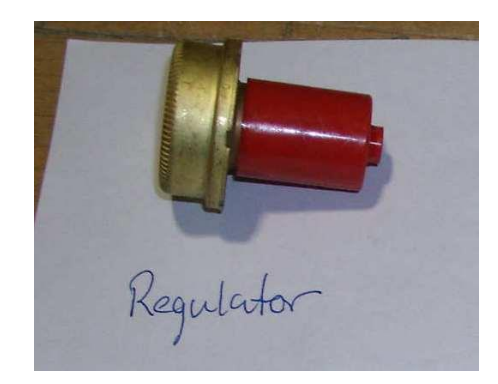
NG ACA-A2902 LP ACA-A2541