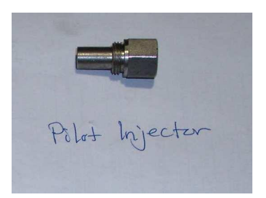
NG ACA-A4047 LP ACA-A4048