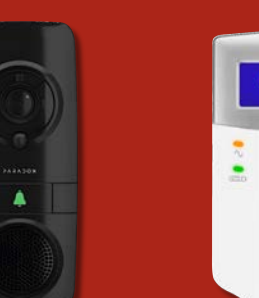
Video Doorbell in White or Black