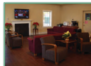
Our Community Park clubhouse facility is equipped with several big screen TVs and is adjacent to our tennis and platform tennis courts.

Our clubhouse facility is equipped with several big screen TVs and is adjacent to our tennis and platform tennis courts. The clubhouse is a great space for your next meeting or a spot to enjoy friends after a tennis match.