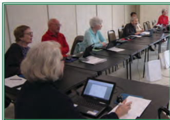
Senior computer classes are offered each spring.

Please visit our office at 108 Rockaway Avenue, visit our website, www.gardencityrecreation.org , or call 516-465-4075 for information on any program. All programs are open to residents of the Village of Garden City.