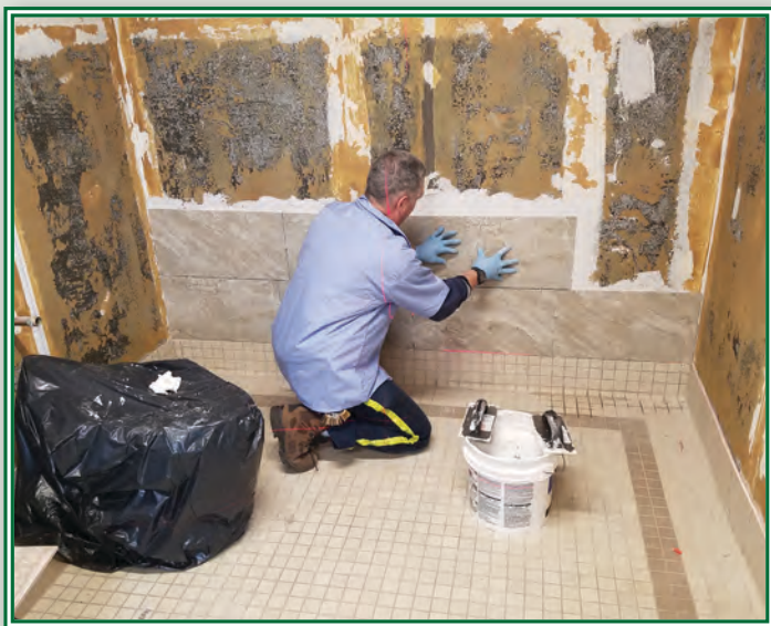
Village staff is completing a full renovation of the interior of Edgemere Park's restrooms, including the installation of new tile board on the walls, new fixtures and lighting.

As the Department enters year three of Phase I of the Strategic Plan emphasis is now placed on the rehabilitation of our neighborhood park buildings. Upgrades to these buildings are being accomplished with a combined effort of in-house skilled staff and private sector contractors.