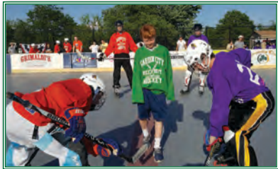
The Department offers roller hockey clinics and leagues for Kindergarten through Adult.

Recreation and Parks offers a variety of programs for young and old each spring season. Program offerings and registration times can be found in the local papers and on our website, www.gardencityrecreation.org . Here are some programs available for the spring: