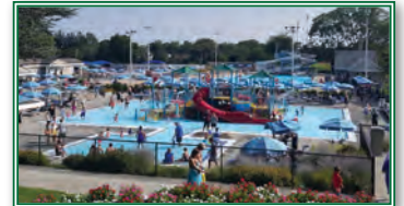
Join friends and neighbors as the Recreation and Parks Department enters its 62nd Pool season.

It's never too early to start planning your visits to the Garden City Pool this summer! By early March, every household will receive our Pool application along with the "Splash" newsletter, which will highlight all the activities and events our community pool has to offer! Events such as "Party Under The Stars," movie nights and themed days enhance the overall experience for each member. New this year will be "Bonus Time," an extra week on the Pool schedule as well as an expanded early bird swim program. Join us as we enter our 62nd Pool season.