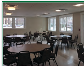
Our new Senior Center facility offers comfortable, climate controlled community rooms year-round at an affordable price.

It's never too early to plan your next event. Whether you are planning a birthday party or group event, or need space for a meeting or just looking to get together with family, friends or co-workers, consider renting one of our Recreation facilities!