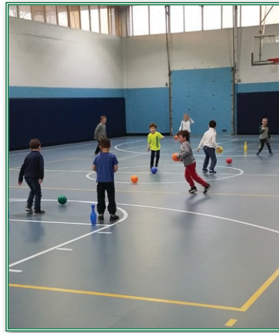
The Department offers fun after school programs