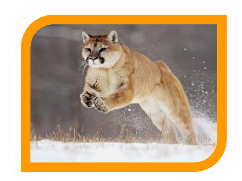
READY TO LEAP!