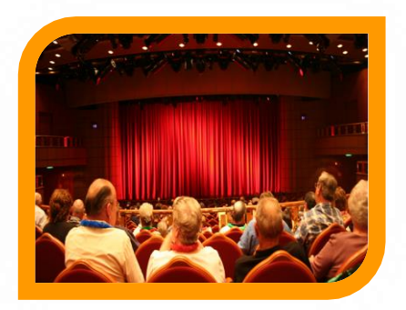
IT'S ABOUT EXPECTATION

Let MEET™ show you how to make the difference in your Brand!