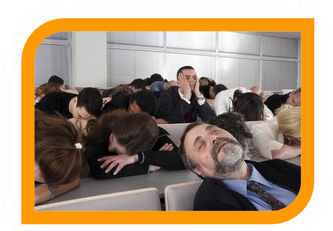
IS IT TIME TO MAKE A CHANGE?