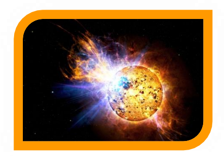
PACKED WITH POWERFUL KNOWLEDGE