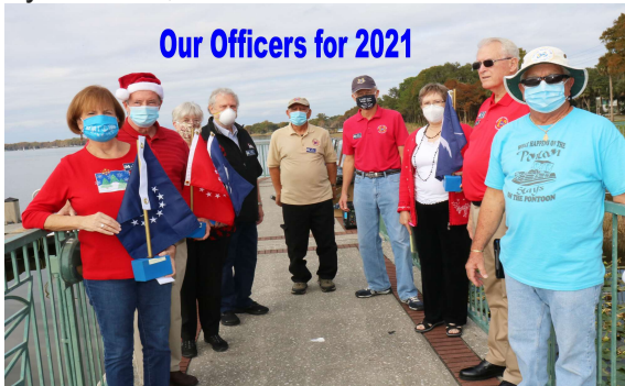
Our Officers for 2021