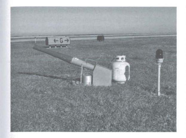
Fig. 4.2. Propane exploders have long been used to repel birds by simulating the sound of a shotgun blast, which is thought to represent a threat to birds.

species-specific responses may vary depending on time of year, reproductive status, and environment in which the control tool is being used.