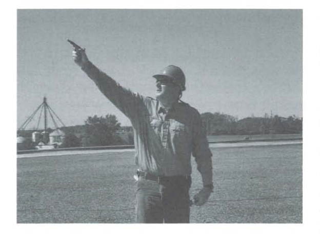
Fig. 4.1. Biologist firing a pyrotechnic device from a specially designed pistol. Pyrotechnics are widely recognized as effective wildlife control tools when used as part of an integrated control program.

limited by context as well as by species behavior and ecology.