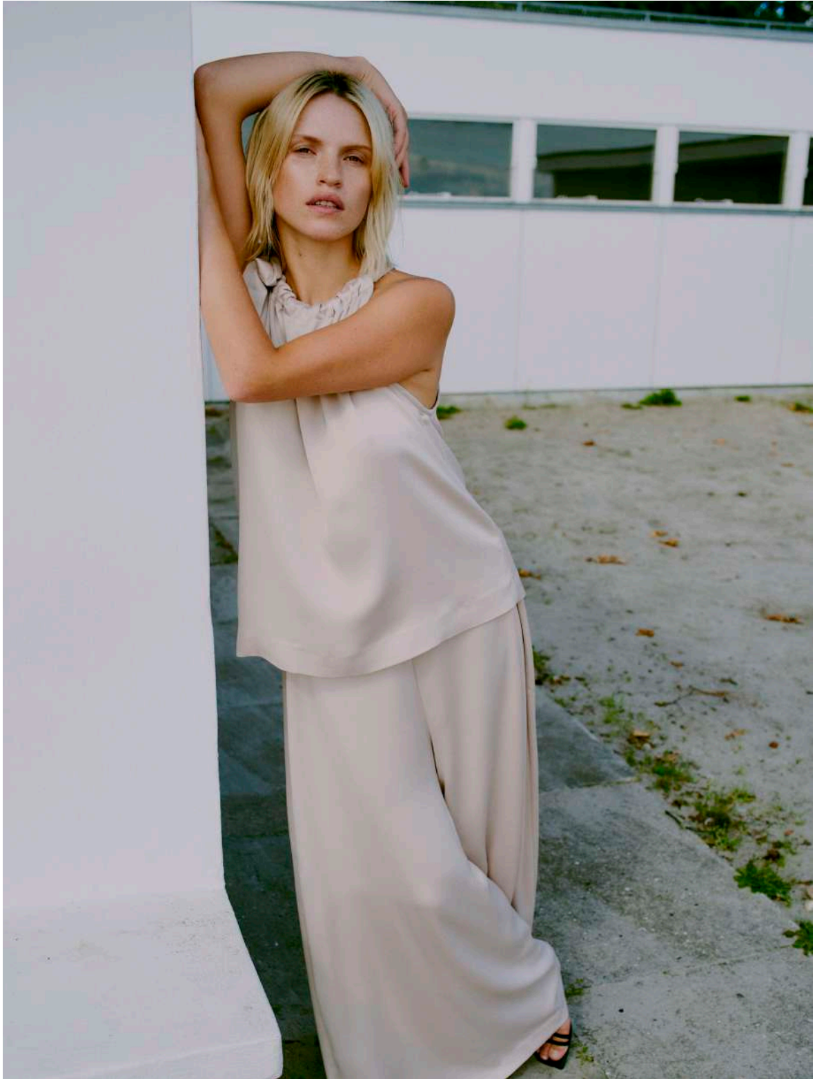
20814863 BYESTO BLOUSE 20814864 BYESTO PANTS