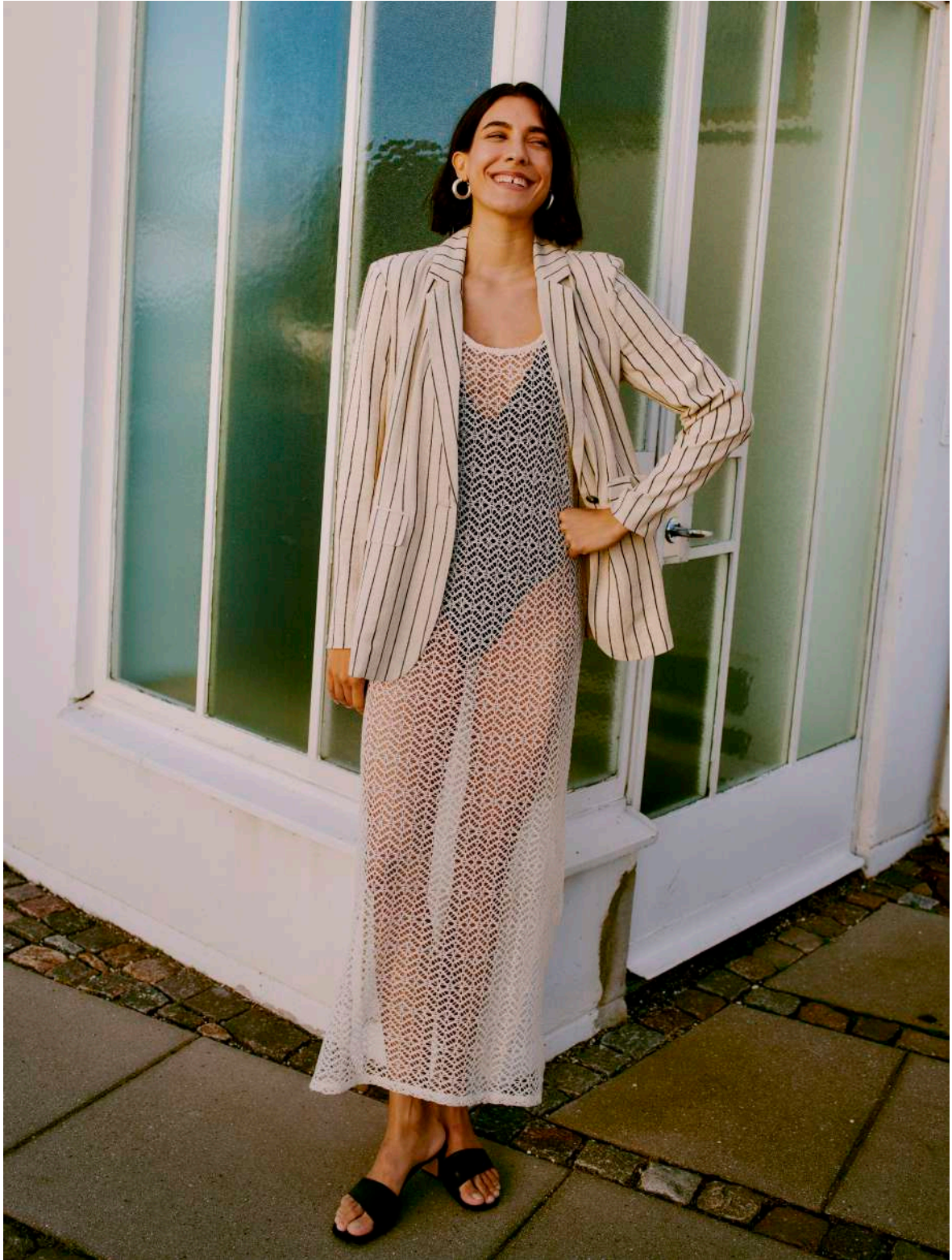
20814850 BYJOHANNA BLAZER 3 20815468 BYMILON DRESS