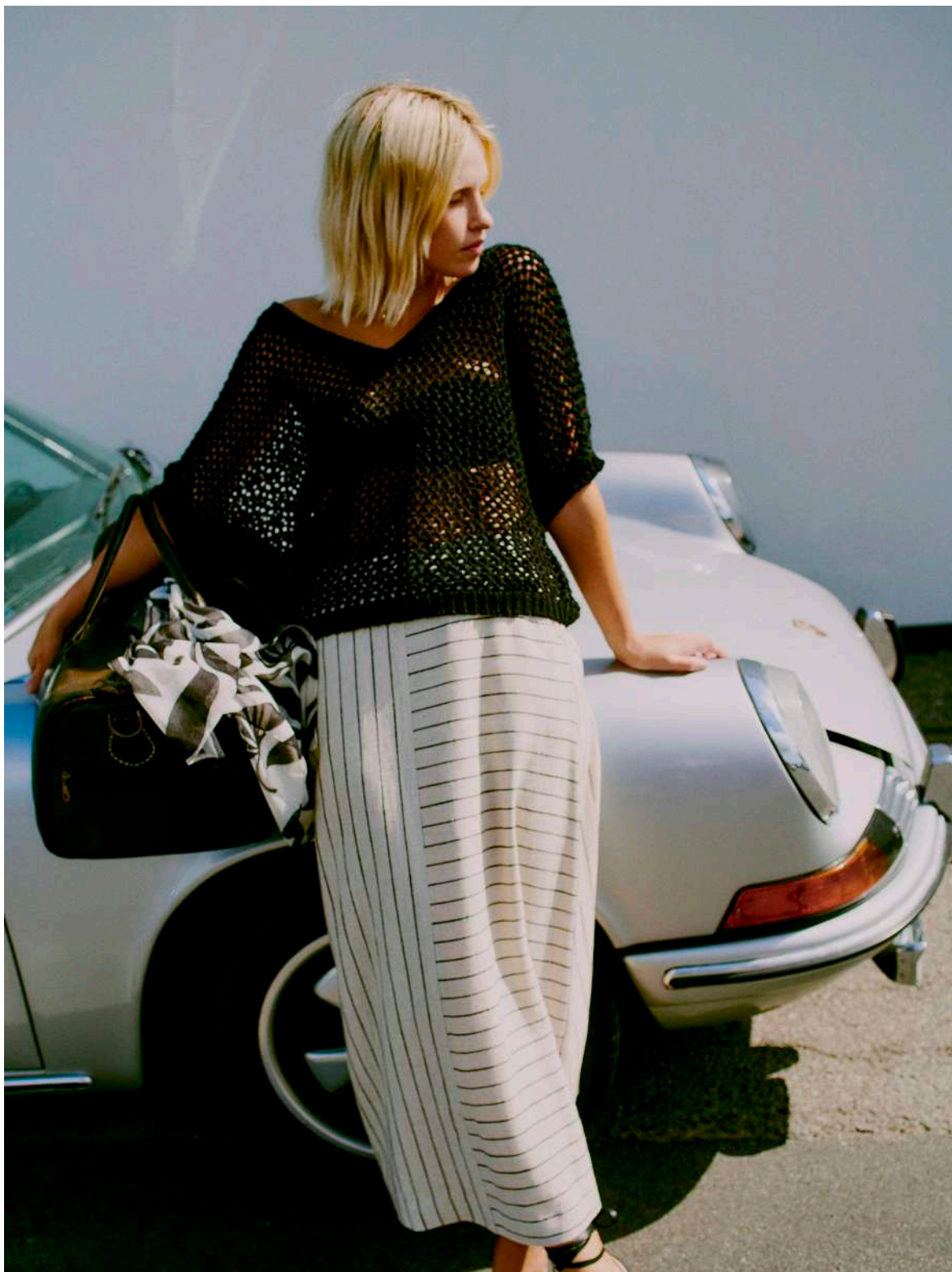
BCI 20814945 BYMARA SS JUMPER 20814853 BYJOHANNA SKIRT 2