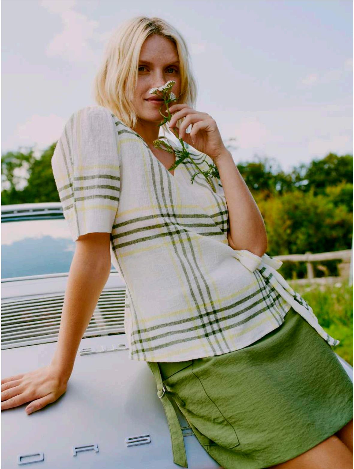
BCI 20814907 BYJOVI WRAP BLOUSE 20814858 BYELAKO SKIRT