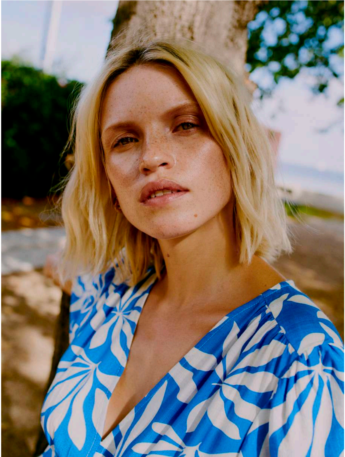
EV 20814938 BYISELA LONG DRESS