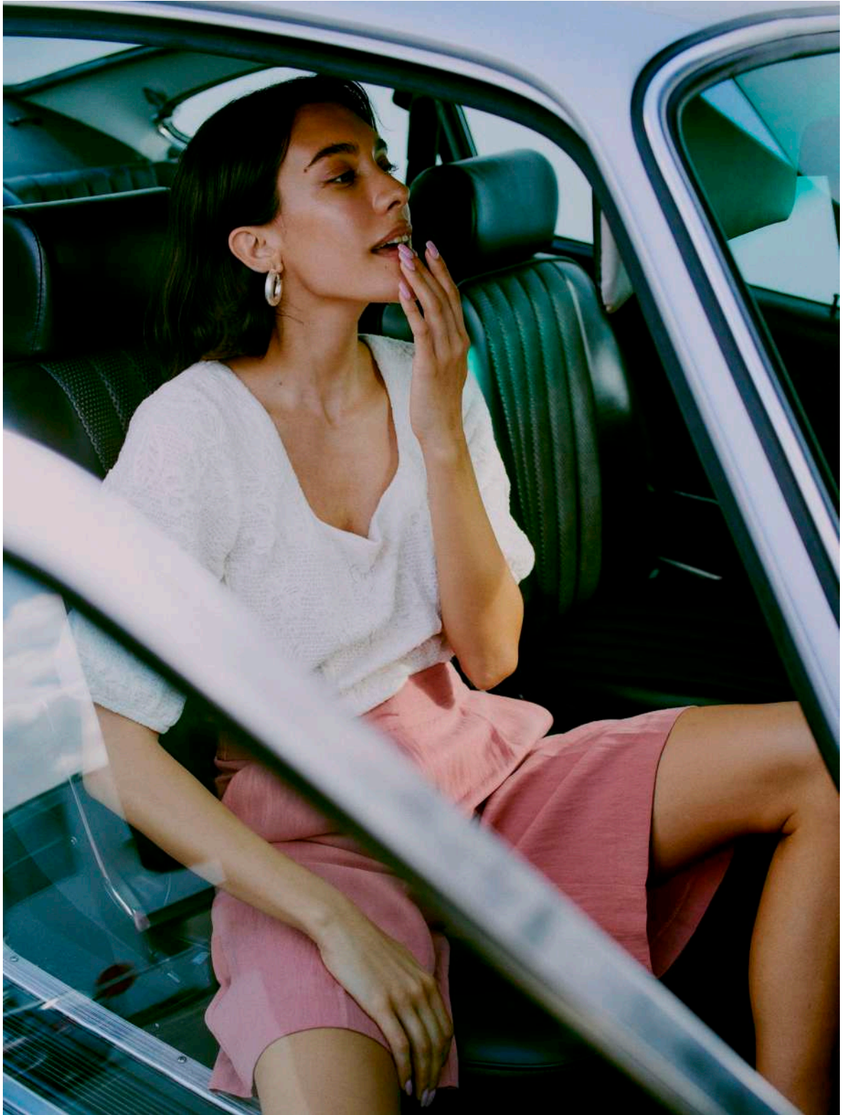
BCI 20814988 BYTULIA TSHIRT 20814867 BYECCERI SHORTS