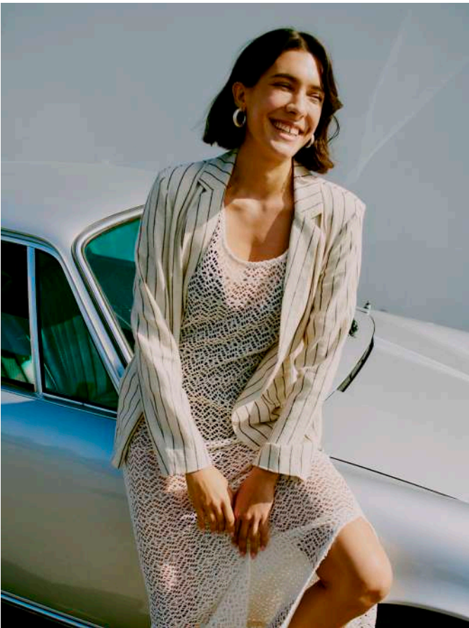
20814850 BYJOHANNA BLAZER 3 20815468 BYMILON DRESS