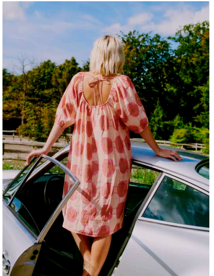
20814921 BYHANVA DRESS