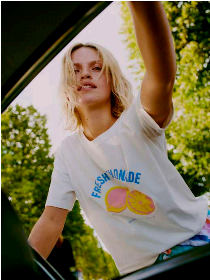
BCI 20815004 BYTENJA TSHIRT 2 20814872 BYDESMOA SKIRT