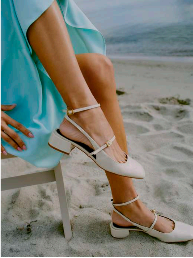
20814865 BYESTO DRESS