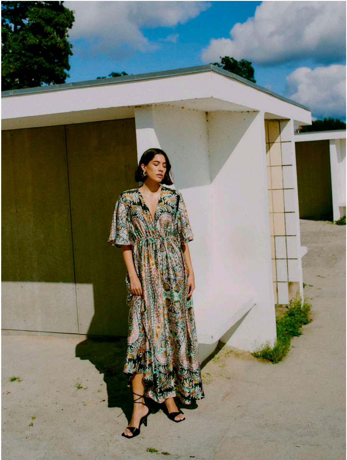
20815746 BYHERMINE DRESS