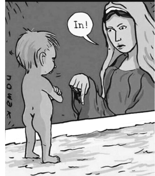
Baby Jesus at bath time.

Next Sunday 9th February FIRST SUNDAY AFTER CHRISTMAS NO SERVICE AT MEREDITH DUE TO ARCHBISHOP'S RETIREMENT SERVICE IN MELBOURNE