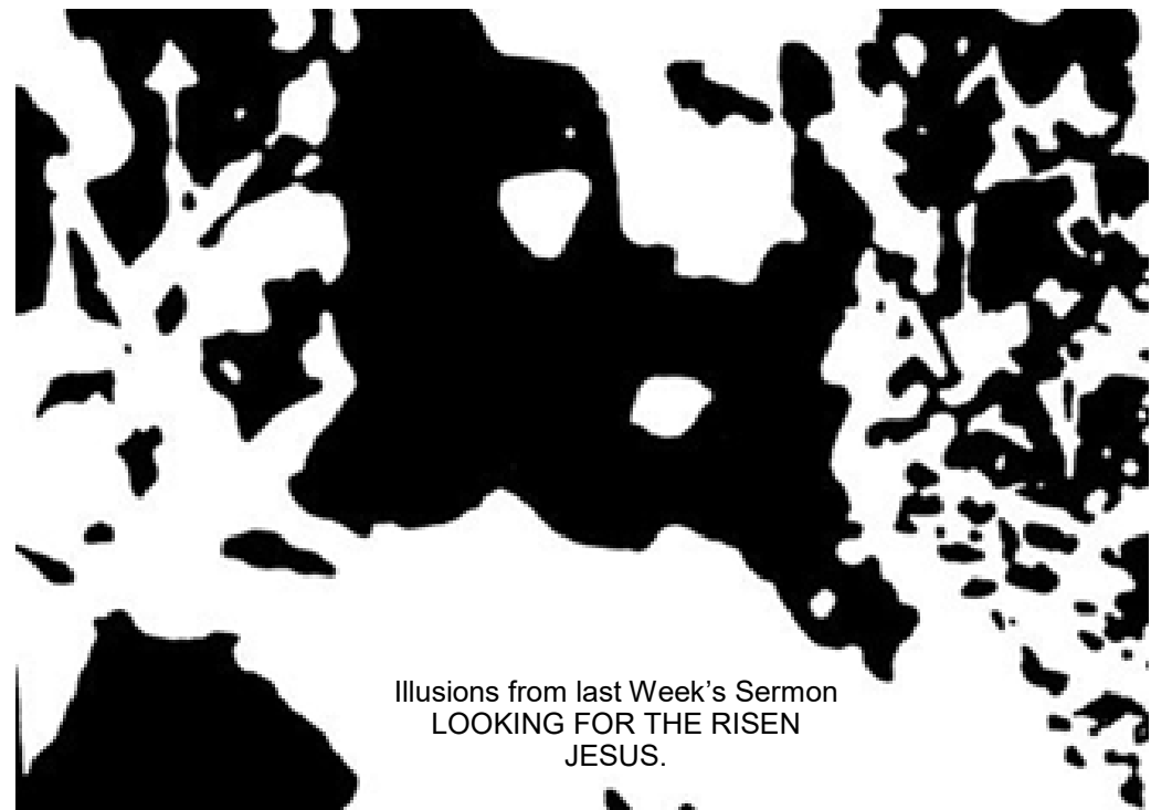
Illusions from last Week's Sermon LOOKING FOR THE RISEN JESUS.