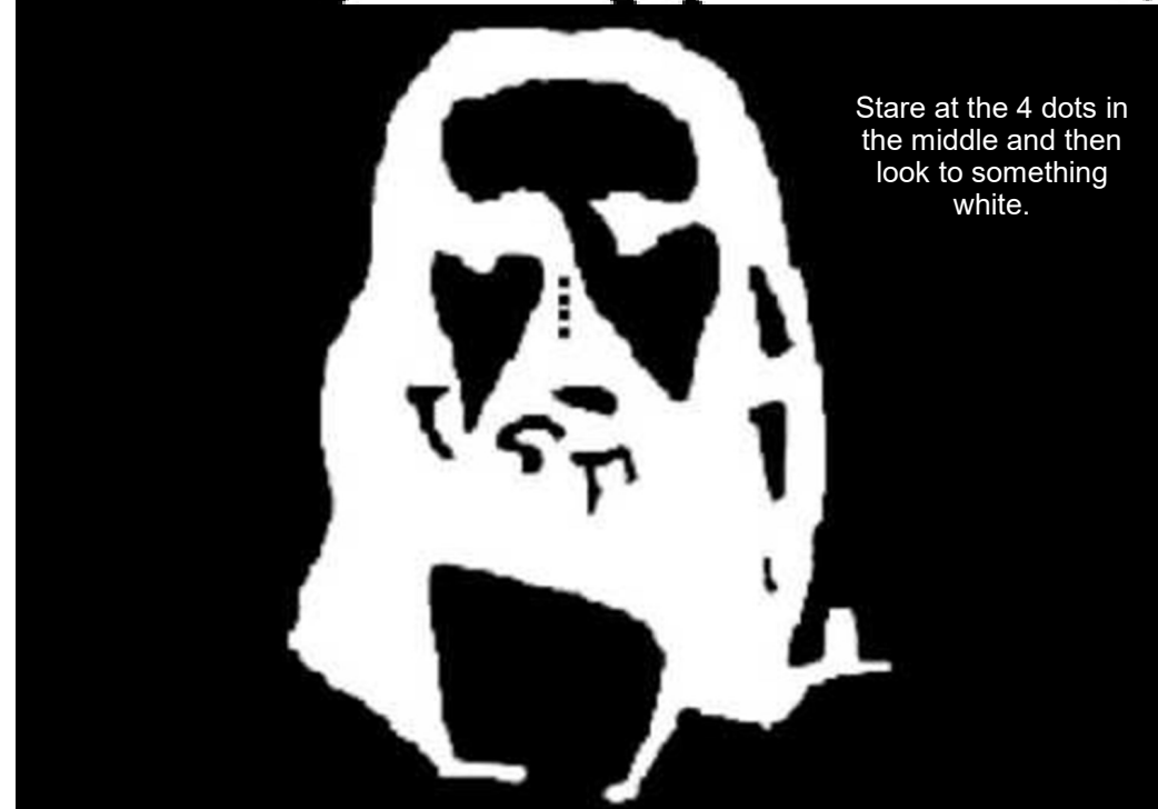
Stare at the 4 dots in the middle and then look to something white.