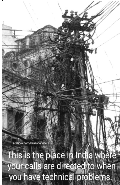
This is the place in India where your calls are directed to when you have technical problems.