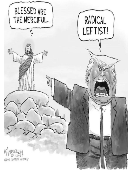
ANDERSON © 1-23-25 IMAGE CONTENT AGENCY

Evening: Ps 119:129-152 Proverbs 30:29-31:9 1 Timothy 6:2c-10 Saturday Morning: Ps 118:1-18 Genesis 30:25-43 Luke 7:11-23 Evening: Pss 118:19-29 & 120 Proverbs 31:10-31 1 Timothy 6:11-21