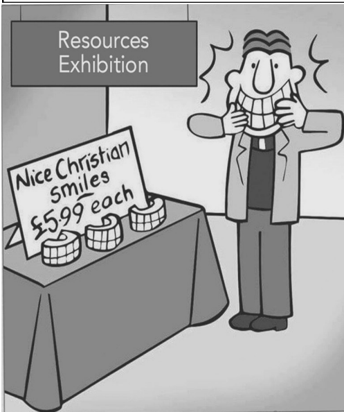
Just what Derek was looking for during these difficult days!