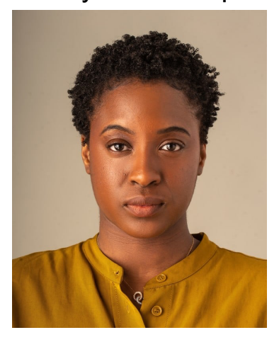
Directed by Tia-Monique Uzor

Tia-Monique Uzor is an artist-scholar who is interested in themes of identity, popular culture, resistance, and feminism within African and African Diasporic dance.