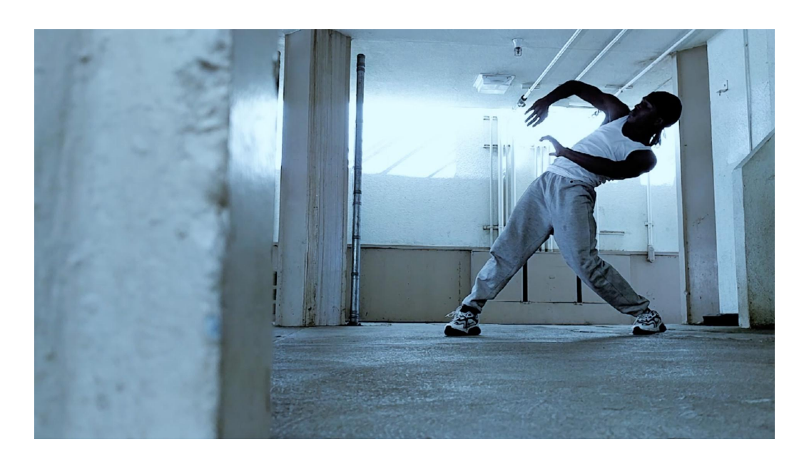
Running Time: 6:13

Spoken word unites with dance in urban sublimeness, seeking and unveiling truth hidden beneath fiction.