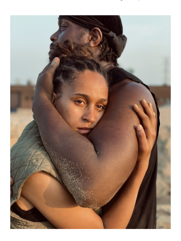
Running Time: 7:15

Intricacies abound of always having to climb uphill in all the imposition facets of life as a colored human being. Whether it be protecting women or going it alone between the sexes, or even as a group.