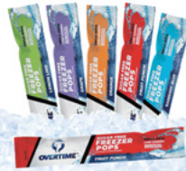
3.0oz FREEZER POPS #50-FREEZERPOPS