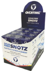
COUNTER TOP DISPLAY #OT-10VAR24CT

OVERTIME™ is a sugar-free electrolyte replacement beverage, precisely formulated for the industrial and construction worker. Overtime provides a healthier re-hydration solution that is low in sodium and high in potassium. Designed to protect the wellness and safety of the workforce without restrictions.