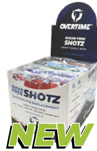
VARIETY SHOTZ PACK #OT-10VAR320CT