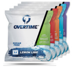
2.5Gal POWDER POUCH #60-POUCH