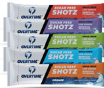
SINGLE SERVE SHOTZ #55-SINGLESERVE