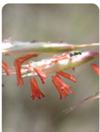
Red-anthered Wallaby-grass ~ Joycea pallida MT