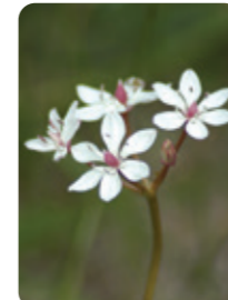
Milkmaids ~ Burchardia umbellata PM