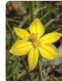
Bulbine Lily Bulbine bulbosa MT