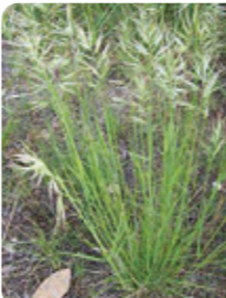
Bristly Wallaby-grass Austrodanthonia setacea LR