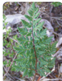
Green Rock-fern Cheilanthes austrotenuifolia IH