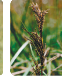
Thatch Saw-sedge Gahnia radula MR-K