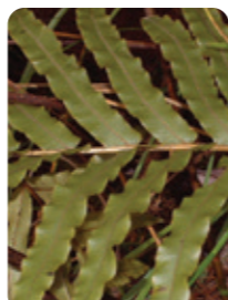
Fishbone Water-fern Blechnum nudum MT