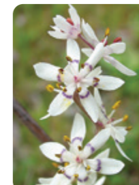
Common Early Nancy ~ Wurmbea dioica ssp. dioica MT