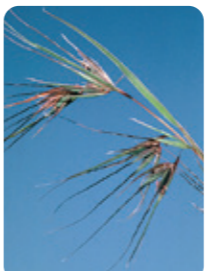
Kangaroo Grass ~ Themeda triandra IM