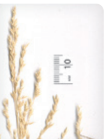
— Flower CSU 20 native, 6 introduced sp