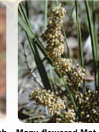
Many-flowered Mat-rush Lomandra multiflora ssp. multiflora IH