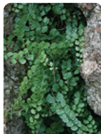
Necklace Fern Asplenium flabellifolium PG