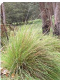
Common Tussock-grass Poa labillardierei MT