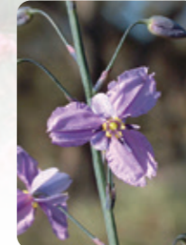
Chocolate Lily Arthropodium strictum MT