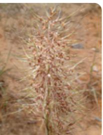
— Flower MT 15 sp of Spear-grass