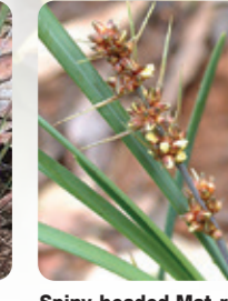
Spiny-headed Mat-rush Lomandra longifolia ssp. longifolia MT