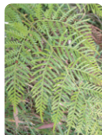
Austral Bracken ~ Pteridium esculentum MT