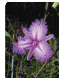
Twining Fringe-lily Thysanotus patersonii RZ