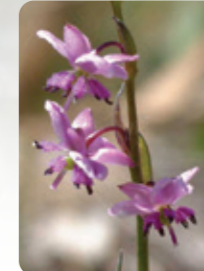
Small Vanilla-lily Arthropodium minus MT