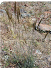
Dense Spear-grass Austrostipa densiflora IH