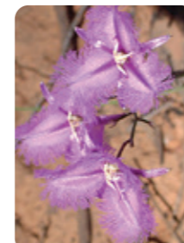
Common Fringe-lily Thysanotus tuberosus MT