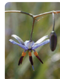
Black-anther Flax-lily Dianella admixta MT