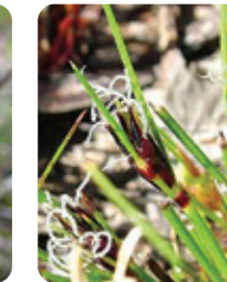
Common Bog-sedge Schoenus apogon TD