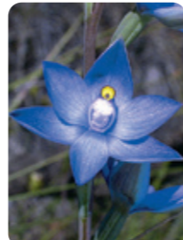
Slender Sun-orchid Thelymitra pauciflora BC