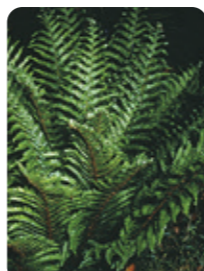
Mother Shield-fern Polystichum proliferum IM