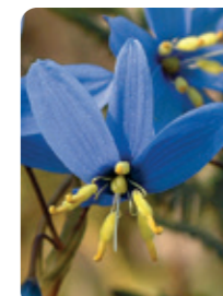
Nodding Blue-lily ~ Stypandra glauca MT