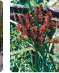
Leafy Flat-sedge Cyperus lucidus MR-K