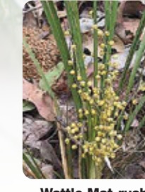
Wattle Mat-rush Lomandra filiformis ssp. coriacea PG