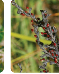
Red-fruit Saw-sedge Gahnia sieberiana PG