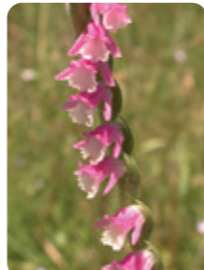
Austral Ladies' Tresses ~ Spiranthes australis EC