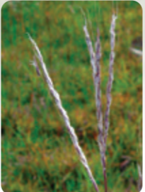
Red-leg Grass ~ Bothriochloa macra RZ