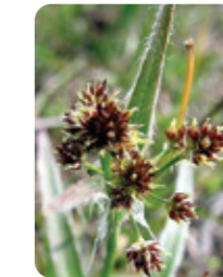
Common Woodrush Luzula meridionalis IH