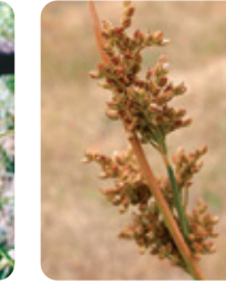
Pale Rush Juncus pallidus TD