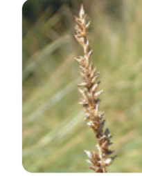
Tall Sedge Carex appressa MT