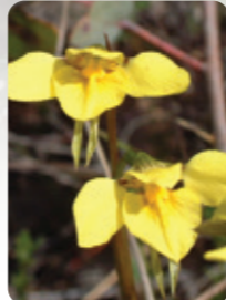
Golden Moths Diuris chryseopsis MT