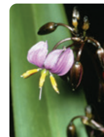
Tasman Flax-lily Dianella tasmanica IM