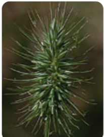
Common Hedgehog-grass ~ Echinopogon ovatus PG