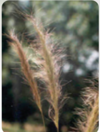
Long-hair Plume-grass Dichelachne crinita JH