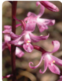
Rosy Hyacinth-orchid Dipodium roseum MT