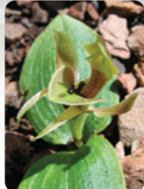
Common Bird-orchid Chiloglottis valida IH