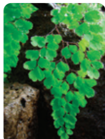
Common Maidenhair Adiantum aethiopicum