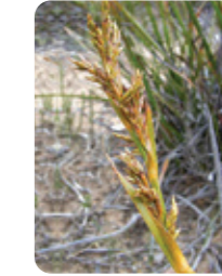
Variable Sword-sedge Lepidosperma laterale LR