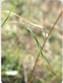
Weeping Grass ~ Microlaena stipoides MT