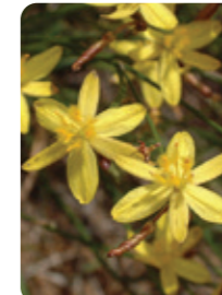
Yellow Rush-lily ~ Tricoryne elatior MT