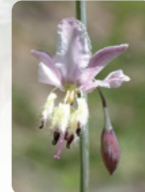
Pale Vanilla-lily Arthropodium milleflorum MT