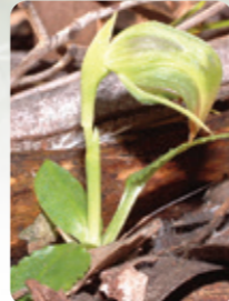
Nodding Greenhood Pterostylis nutans MT