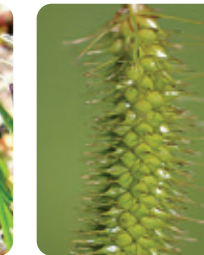
Tassel Sedge Carex fascicularis PG