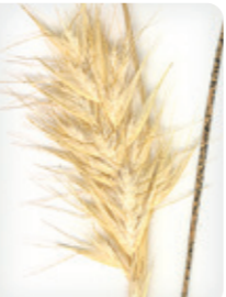
— Flower CSU 20 sp of Wallaby-grass