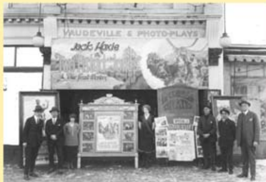
The Empress Theatre, ca. 1929-30

This presentation will chart the history of the beleaguered Empress Theatre, starting from 1911 when the Starland Theatre Company transformed part of the Co-Operative Block (1902) into a store-front theatre, and focus on the period from 1949 to 1959 when the facility was operated as a Famous Players affiliate. A discussion of the EPCOR Centre and the "resurrection" of the Empress in 1991 will conclude the presentation.