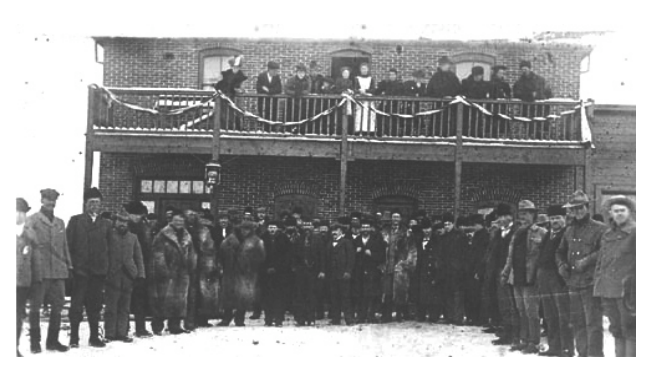
Boer War Volunteers, Pincher Creek December 1899