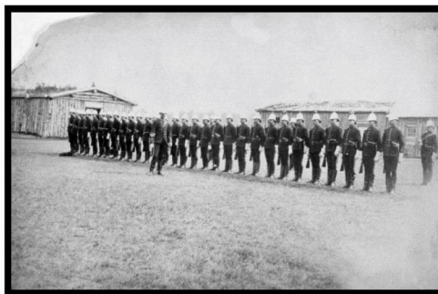
"F" Troop, NWMP at Fort Calgary, 1876 Courtesy Glenbow Archives NA-354-10

Meet: Fort Calgary Historic Park, 750 - 9 Avenue SE