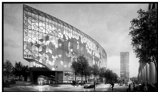
Looking to the future. The New Central Library

The support of Calgary Public Library has been crucial in planning and executing HCW 2015. In particular, the Local History Room of the downtown library is a wonderful source of information and inspiration.