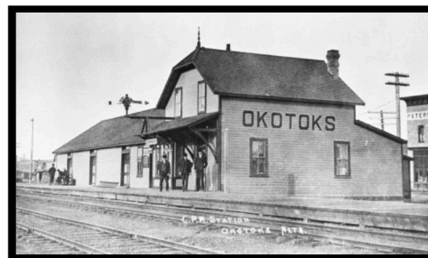
CPR Station, Okotoks, ca 1912

Meet: Okotoks Museum and Archives, 49 North Railway Street, Okotoks