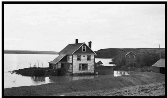
Sam Livingston's house, Glenmore Lake, ca 1932

Meet: Heritage Park's Orientation Centre located in the Canadian Pacific Railway Station near the front entrance to the Park, 1900 Heritage Drive SW. After this free program, visit these houses "in person" and enjoy the rest of the Heritage Day celebrations at Heritage Park (paid admission applies).