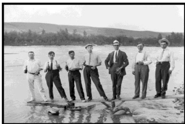
Law students beside Bow River, Bowness Park, 1915

Meet: Central United Church, 131 - 7 Avenue SW