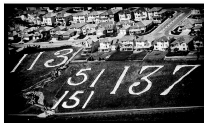
Battalion Park, ca 1995

Meet: Signal Hill Shopping Centre, 5660 Signal Hill Centre SW, at the base of the stairs leading to Battalion Park next to the Staples store. The performance will be in a tent and chairs will be provided. Please note: The climb up the stairs to Battalion Park and the Signal Hill Stones is strenuous. Please ensure that you wear appropriate footwear.