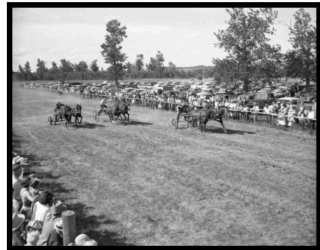
Millarville Cart Race, July 1954

The 19 th Annual Millarville Rodeo starts at 1:00 pm. Tickets available at the grounds. Afterwards shop and have lunch at the Millarville Farmers' Market.