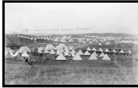
Sarcee Camp, Calgary, 1911 Courtesy Glenbow Archives NA-1632-1