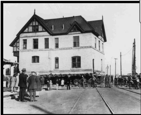
Costigan house built in 1895 at 1 Street and 17 Avenue SW, moved to 219 - 17 Avenue SW in August 1928 Col. Samuel B. Steele once lived in this house

Meet: Cliff Bungalow-Mission Community Centre, 2201 Cliff Street SW