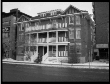
Hester Apartments, December 2013

Meet: In front of Memorial Park Library, 1221 - 2 Street SW