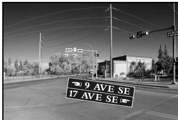
When Avenues Collide - 9 Avenue and 17 Avenue SE

Meet: John Dutton Theatre, Central Library, 616 Macleod Trail SE