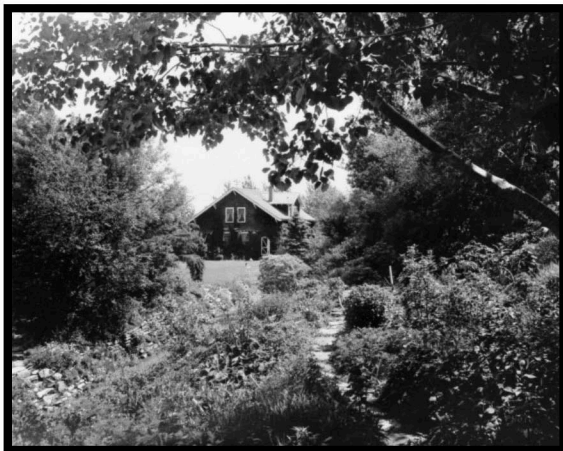
William R. Reader's house and garden, n.d.

Meet: Reader Rock Garden, 325 - 25 Avenue SE, corner of 25 Avenue and Macleod Trail SE, near the Ertlon CTrain Station