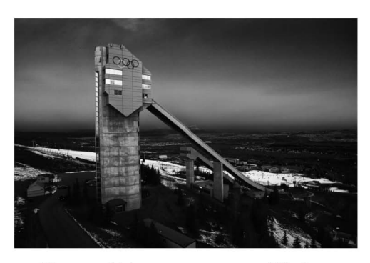
90 metre ski jump tower

Repeat of Sunday, July 28 at 2:00 pm. See page 9 for details.