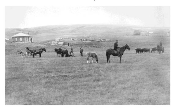
William Bruce Farm, 1894 Brentwood Shopping Centre was built here in 1963.

Meet: Central United Church, 131 - 7 Avenue SW