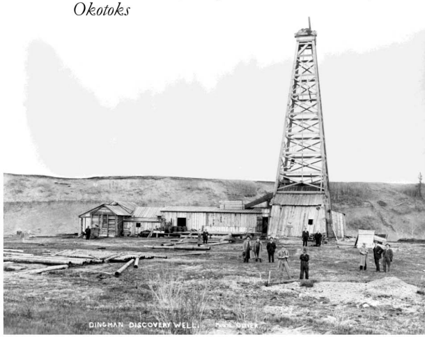
Visitors to Dingman #1 well, Turner Valley, 1914

Meet: At the cemetery located on Big Rock Trail and Westland Road (west of Okotoks Ford Dealer),