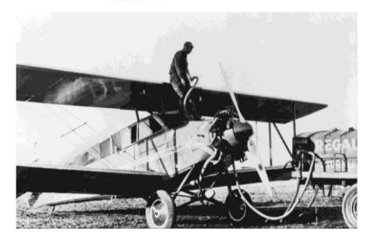
Fuelling Stinson Detroiter, ca. 1928 Freddy McCall flew nitroglycerine in this plane.

Meet: Fort Calgary Historic Park, Burnswest Theatre, 750 - 9 Avenue SE