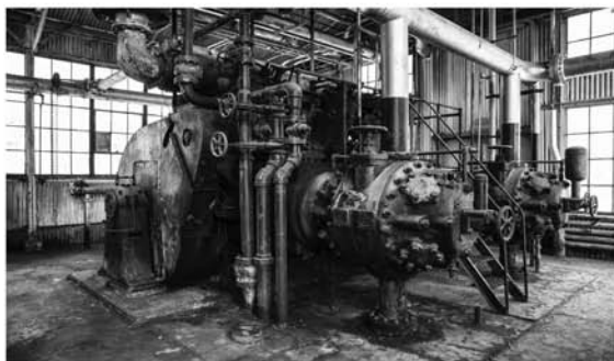
The compressor building at the Turner Valley Gas Plant

Meet: When driving from Calgary on Highway 22, at the 4-way stop in Turner Valley turn left. Bear right onto Sunset Blvd SE almost immediately. Proceed to the parking lot at the Plant.