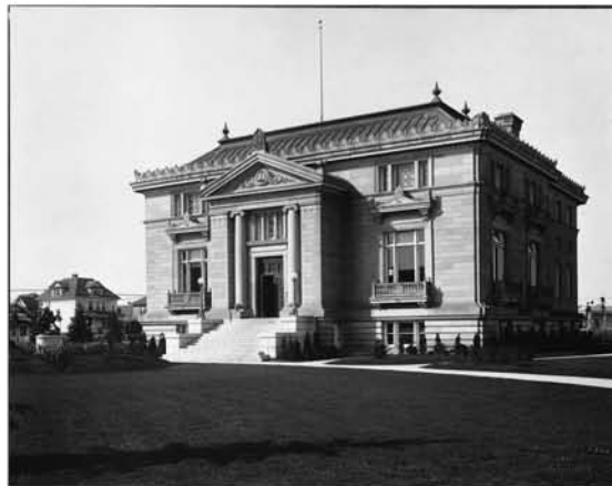
Calgary Public Library, ca 1912

Meet: Memorial Park Library, 1221 - 2 Street SW