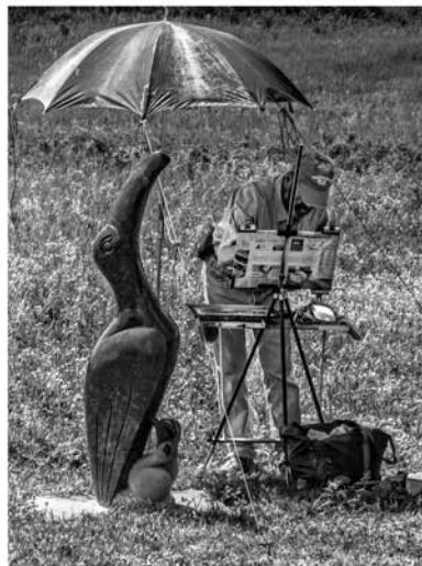
Artist at work, Leighton Art Centre

Meet: Memorial Park Library, 1221 - 2 Street SW