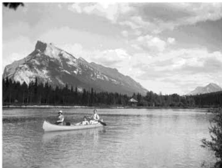
Canoeing on the Bow River, Banff, ca. 1920