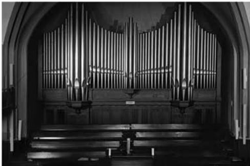
Central's Casavant Frères Organ

Meet: Central United Church, 131 - 7 Avenue SW