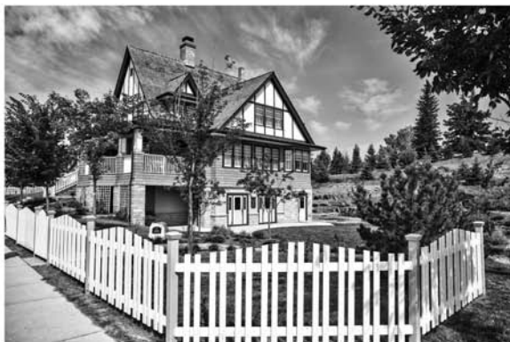
Replica of Nellie McClung's Calgary home

Meet: Heritage Park Historical Village Railway Orientation Centre (outside the front gate) 1900 Heritage Drive SW