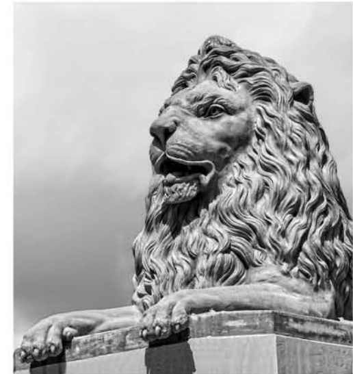
Guardian of the Centre Street Bridge Courtesy Walt DeBoni