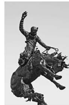
Statue of cowboy riding bucking bronco

Meet: Details provided at time of registration