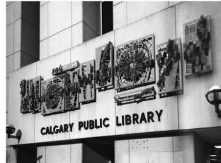
Central Library enameled metal frieze

Meet: John Dutton Theatre, second floor Central Library, 616 Macleod Trail SE