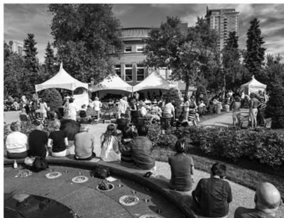
Honens Music in the Park, 2014

Meet: Union Cemetery entrance Spiller Road and Cemetery Road SE