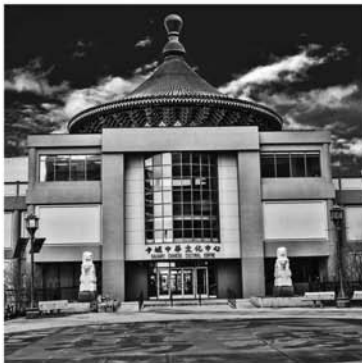
Calgary Chinese Cultural Centre

Meet: East entrance of Calgary Chinese Cultural Centre 197 - 1 Street SW