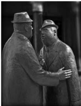
Conversation

Winning entrants of the Crossword Puzzle and the History Hunt will be entered into a draw for several prizes. Prize sponsors will be recognized on our website. We appreciate the contribution to HCW 2018 from our prize sponsors.