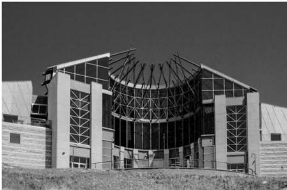
Blackfoot Crossing Historical Park

Meet: Blackfoot Crossing Historical Park East on Hwy 1, south on Hwy 842 6.4 km south of Cluny