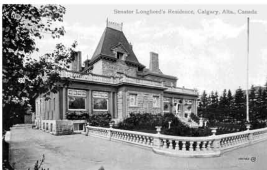
Senator Lougheed's Residence, ca 1914

Meet: Lougheed House, 707 - 13 Avenue SW