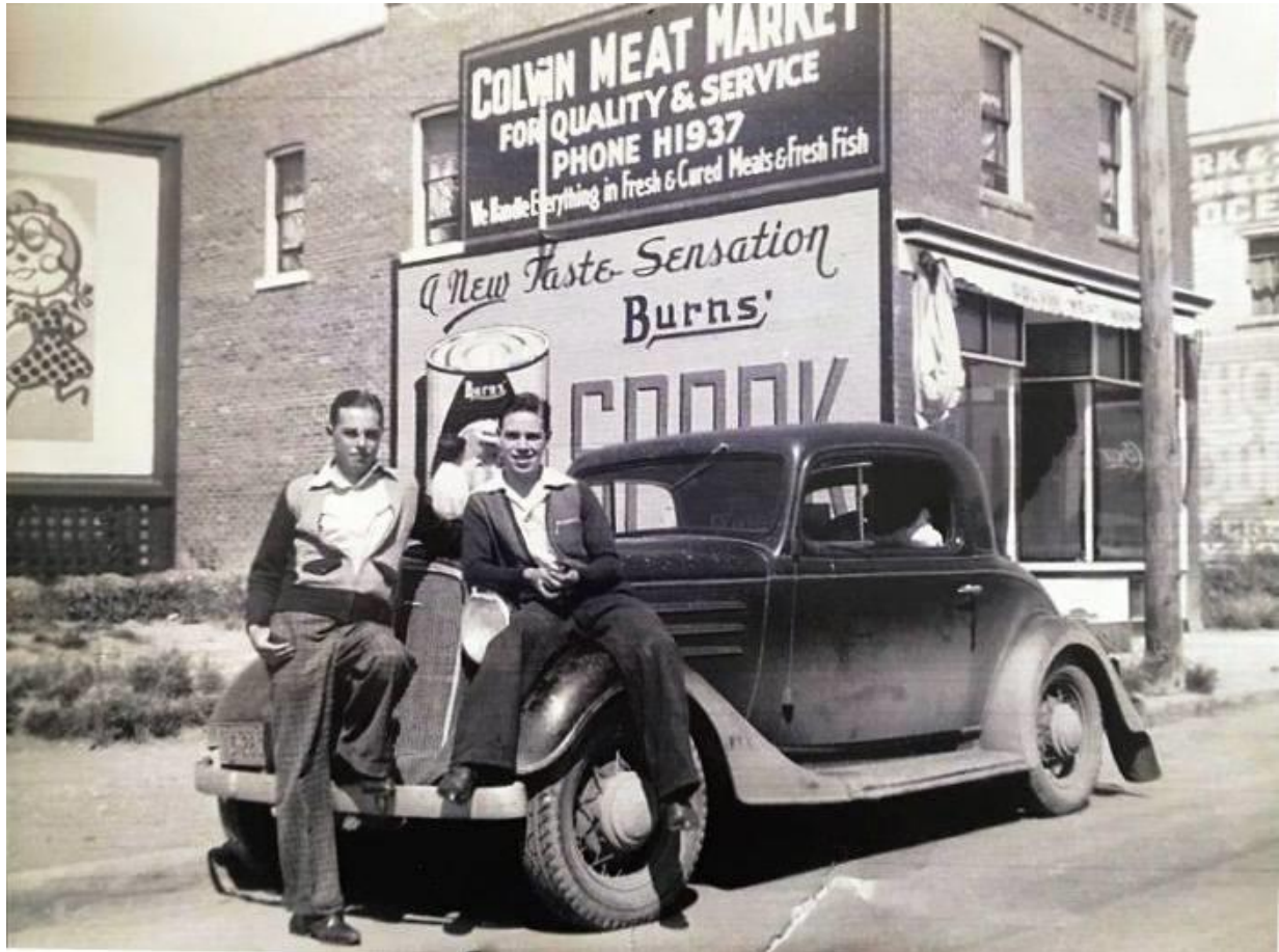
Burns "Spork". Yum!

This old picture- apparently dated 1938- shows Colvin Meat Market, looking northwest from Edmonton Trail. Out front are a couple of young men posing beside their coupe, and one of the pair is a Colvin. There will be undoubtedly be someone here who can confirm the year and make of the car! Just to the north of the meat market- at the far right- is a grocery store which is no longer there.