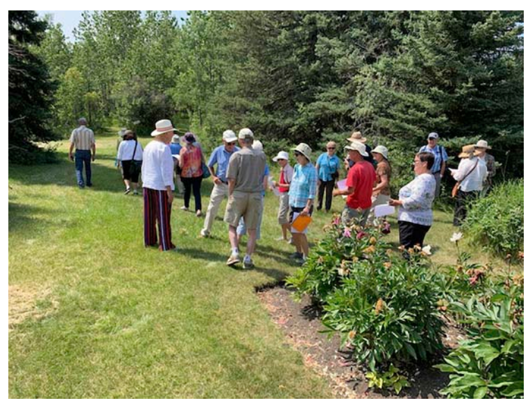
Dover Gardens tour, above, Games Inside and Out, Heritage Park, right.