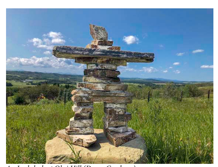
An Inukshuk at Oksi Hill (Dover Gardens.)