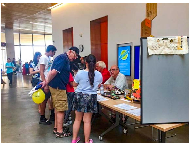
The CCHS booth at the Calgary Public Library's Family Heritage Festival in the Central Library.