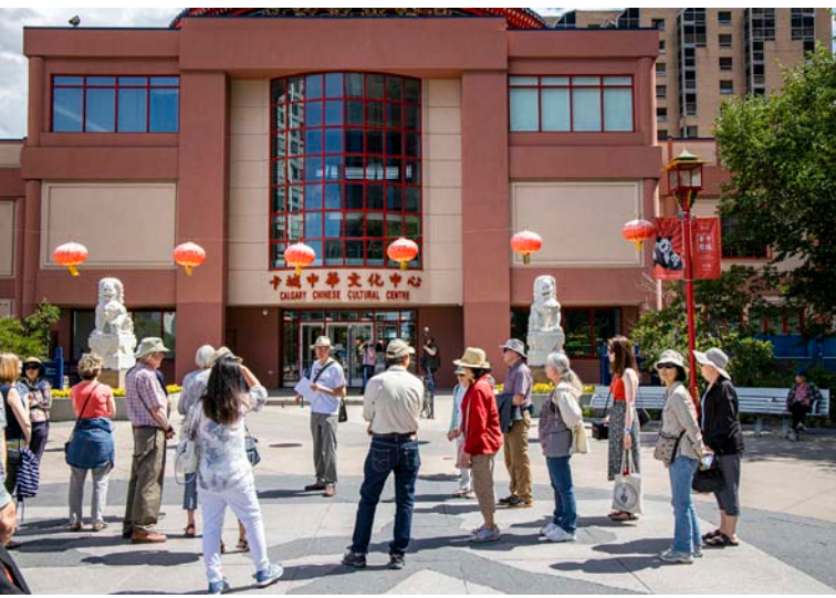
Lloyd Sciban's tour of Chinatown.