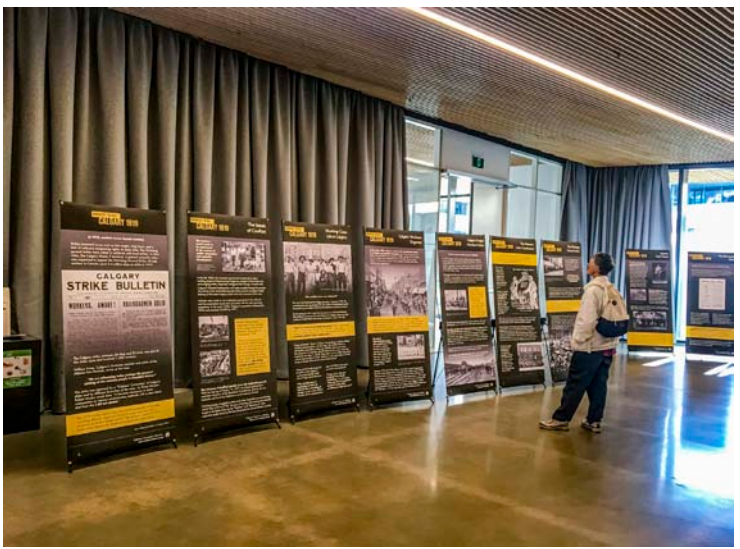
Banners highlighting the Calgary Strike of 1919.