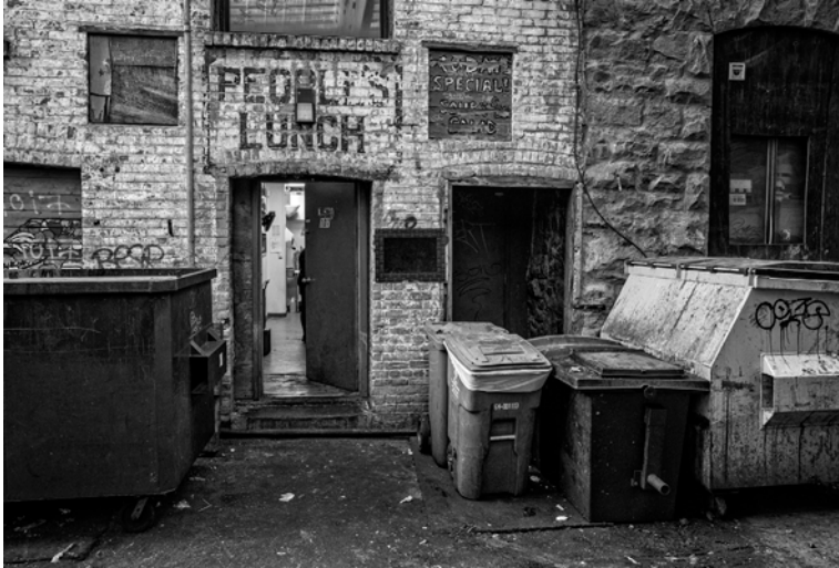
Ghost sign in a back alley between Stephen Avenue and 9th Avenue SW.