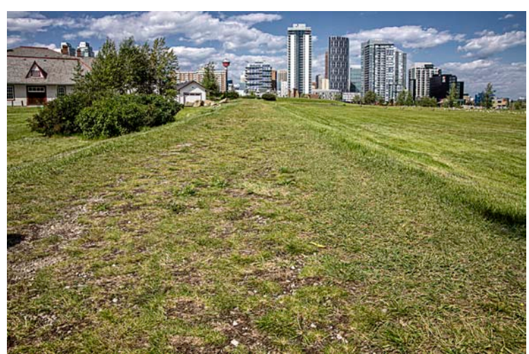
Remnants of the Grand Trunk Railway track bed into Fort Calgary.