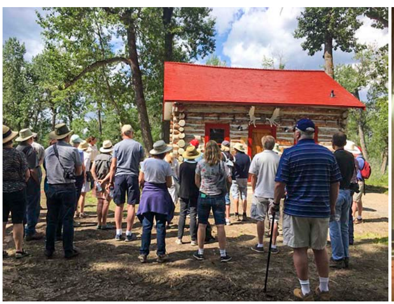
Tour of the EP Ranch.