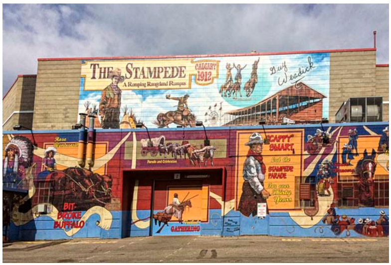
Mural on the east facade of the Corral.