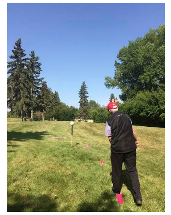
Fun and Games in Fish Creek Provincial Park.