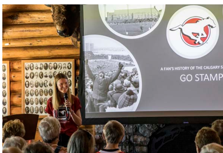
Shelly McElroy, A Fan's History of the Calgary Stampeders.