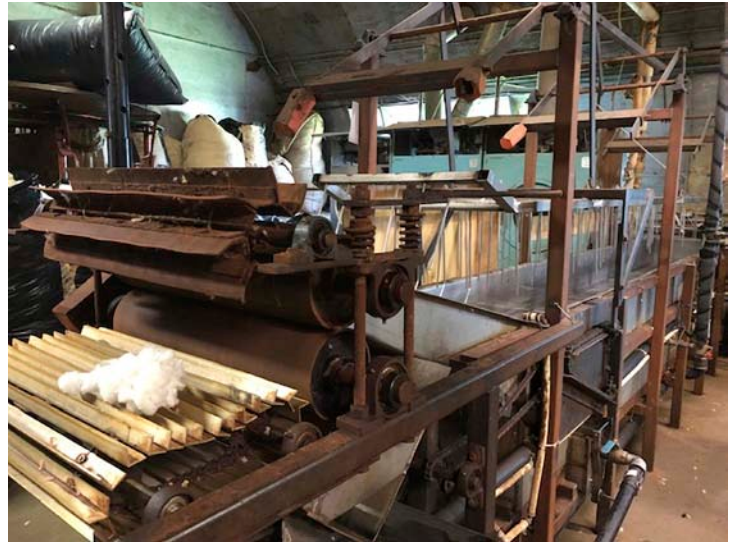
Machinery at Custom Woolen Mills.