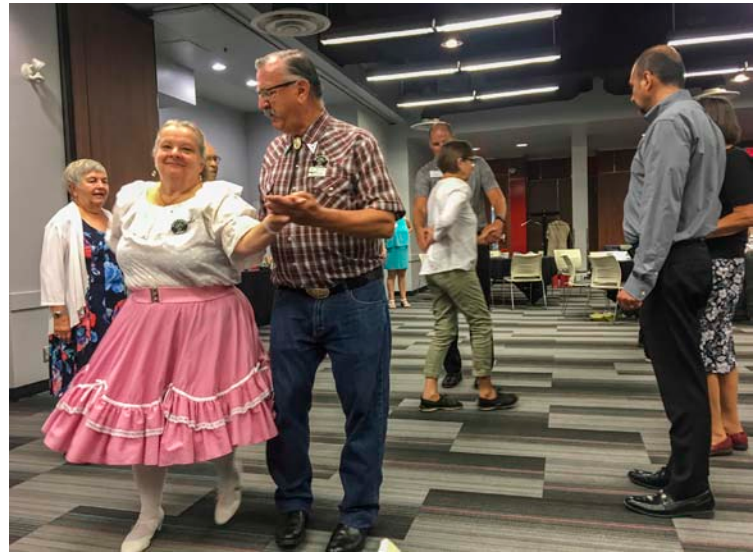
Square Dancing at the University of Calgary on 8th Avenue SW.

Square Dancing is not something that I associate with universities, but that was the focus of the presentation of the U of C this year. First, we participated in a pancake breakfast, then had an expertly prepared presentation on the history of square dancing. (Who knew that while square dancing in North America is declining, young people are actually taking it up in Europe!) This was followed by demonstration dances by two local clubs and of course finally, we were all invited up to join them. This was fun.