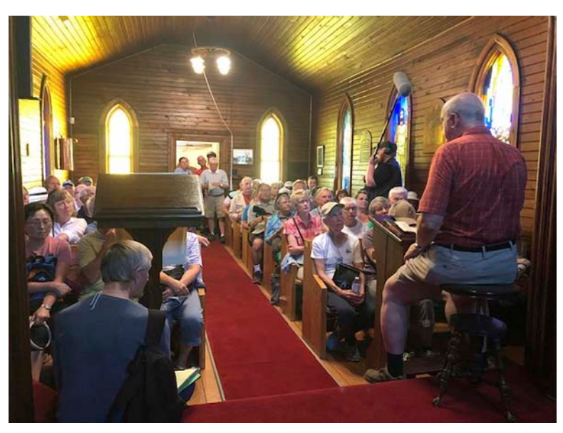
The View from the St. Paul's Anglican Church Altar.