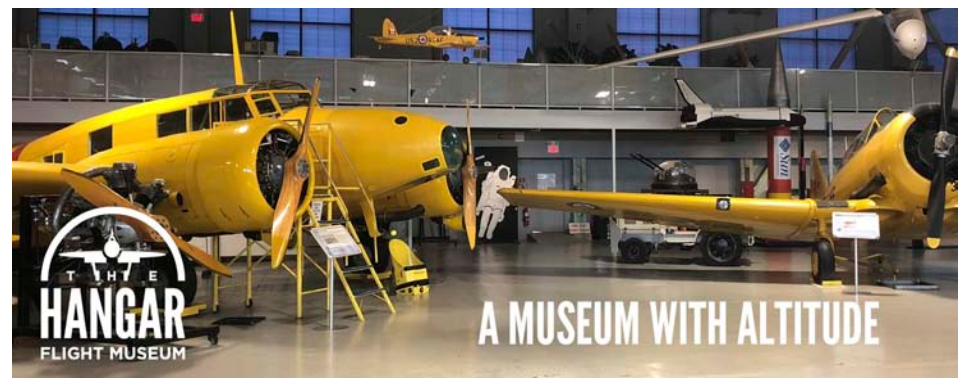
Views at the Hangar Flight Museum, above and right.