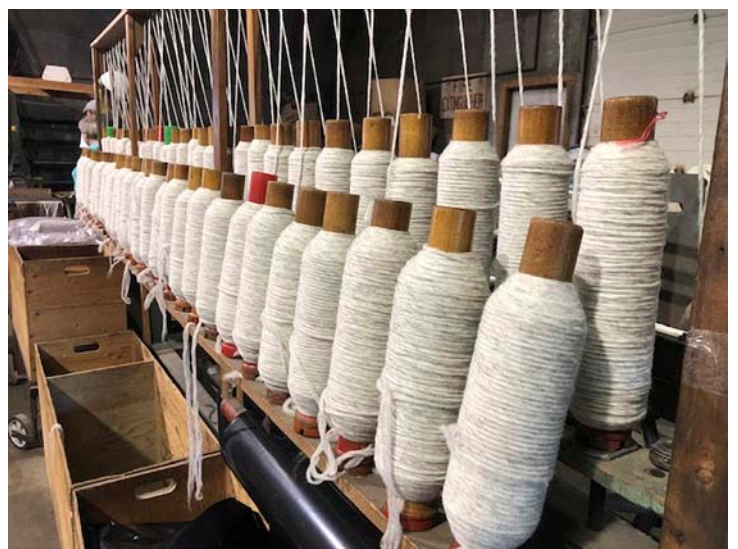
Spools of wool at Custom Woolen Mills.