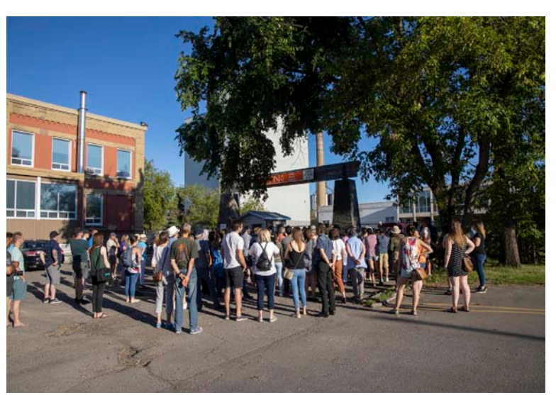
Tour of the historic Calgary Brewery site.