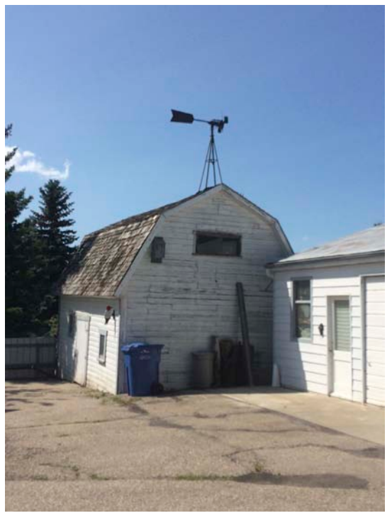
Webster's barn, Chestermere.