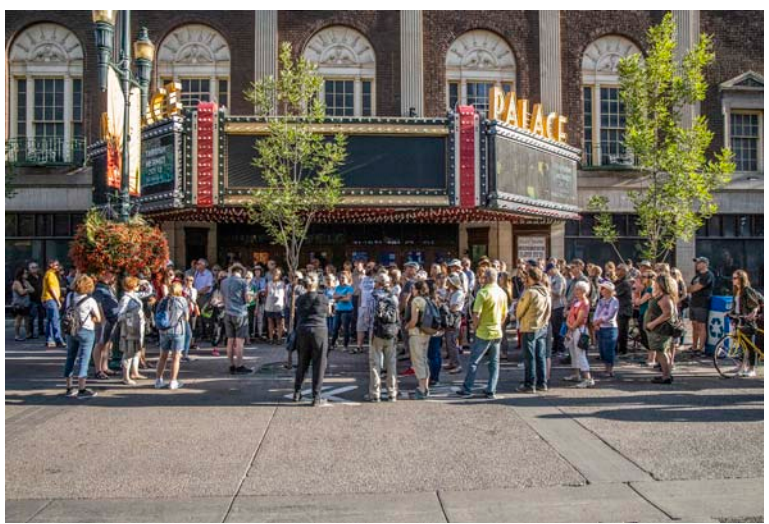
Josh Traptow's Ghost Signage tour met in front of the Palace Theatre on Stephen Avenue.