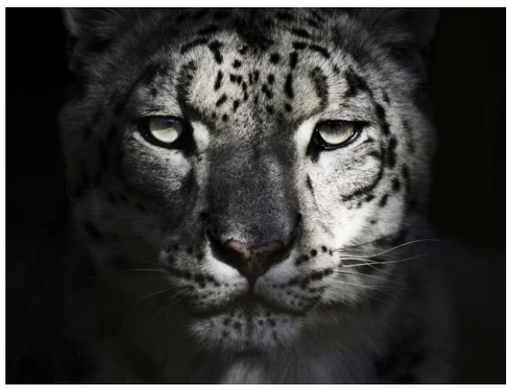
Snow Leopard, Calgary Zoo Eurasian Area