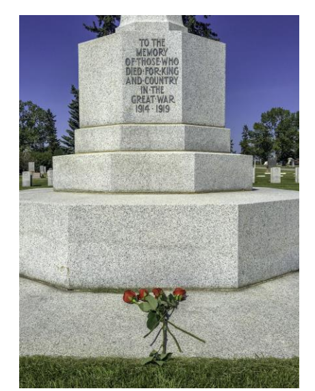
WW I Memorial, Union Cemetery