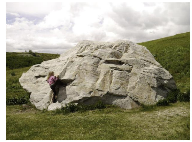
Nose Hill Erratic

or Copy & Paste into your email: nosehill@chinookhistory.ca