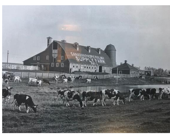
Canadian Pacific Supply Farm No. 1