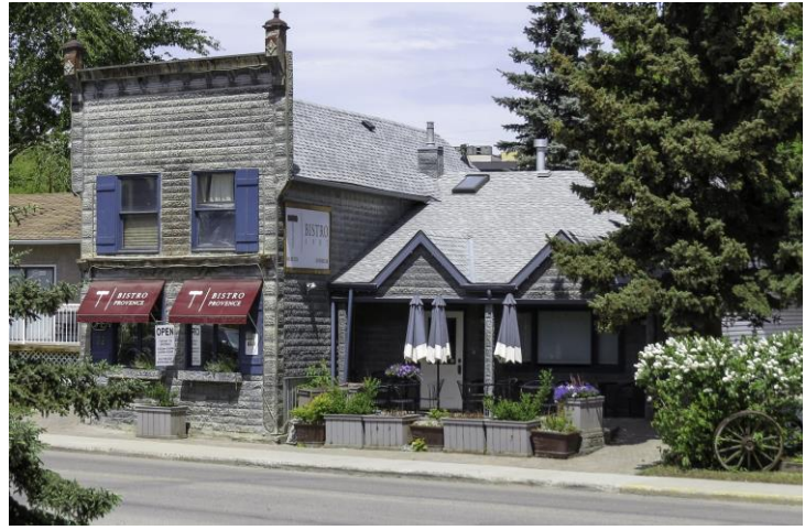
Former Post Office, Okotoks

or Copy & Paste into your email: parkdale@chinookhistory.ca