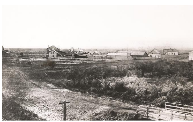
Macleod Trail, High River ca. 1902