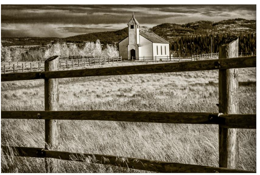
McDougall Memorial United Church

Registration not required – a drop-in event Location: 26 km west of Cochrane on the 1A highway