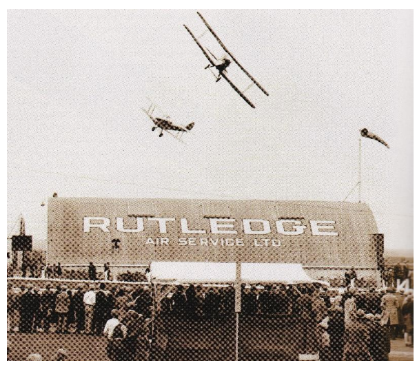
Air Show – Opening Renfrew Airport 1929 NA-3691-32