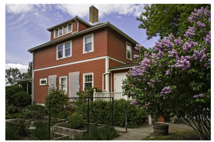
Deane House and Garden