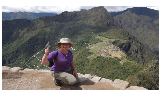
This is not Glenbow Ranch Park (It's Peru)

or Copy & Paste into your email: hcwdeane@chinookhistory.ca