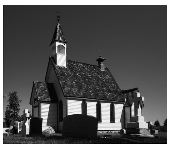
St. Paul's Anglican Church, Midnapore