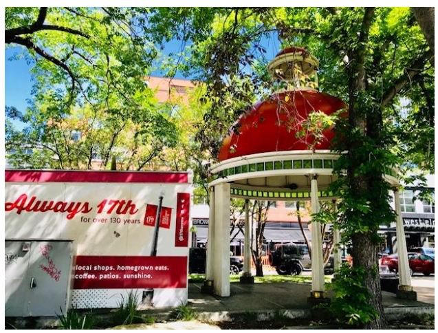
Red Gazebo, Tompkins Park, 17 Avenue & 8 Street

or Copy & Paste into your email: 17ave@chinookhistory.ca