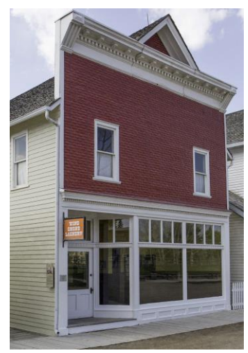
Wing Chong Laundry, Heritage Park