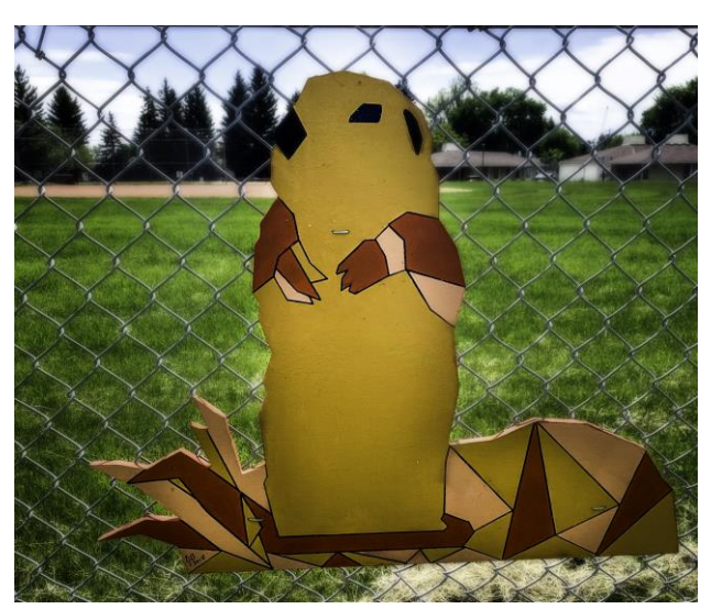
A "beaver" in Bridgeland