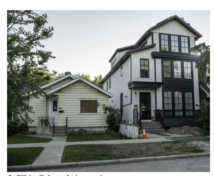
Infill in Calgary's inner city

Every year older homes in inner-city communities are replaced. Is this an invasion in our inner-city communities or just a healthy upgrading of the housing inventory to meet current housing needs for people of all ages and backgrounds? What about heritage? How many older homes do we need to preserve? What about diversity? Can we have both? Calgary blogger and flaneur, Richard White, gives his take on the evolution in our older neighbourhoods.