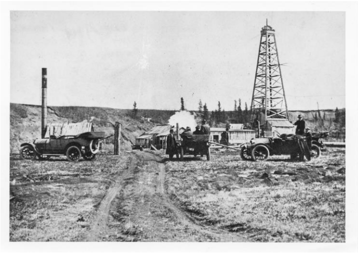
Turner Valley Oilfield ca. 1920 Photo courtesy Glenbow Archives NA-4139