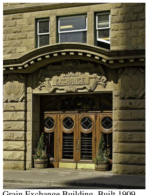
Grain Exchange Building, Built 1909