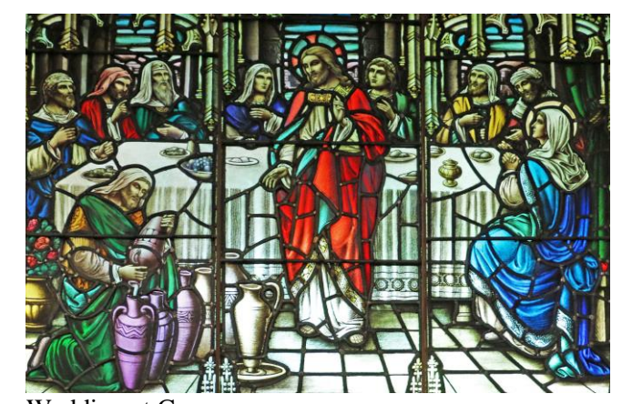
Wedding at Cana