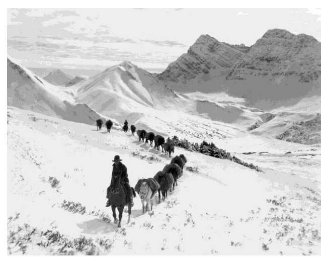
Pack train in mountains