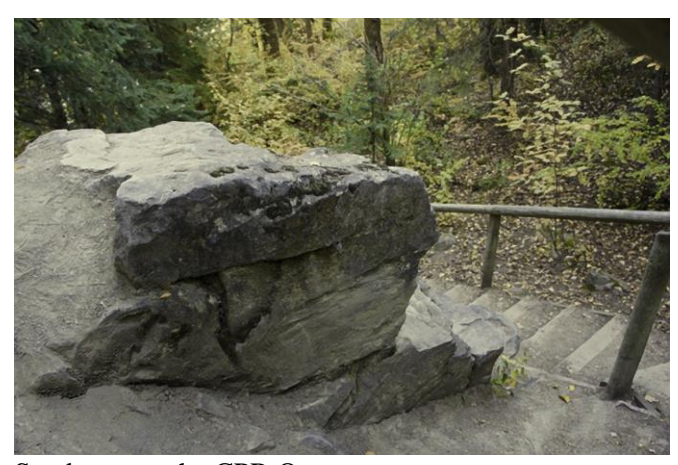
Sandstone at the CPR Quarry

10:00 am — Leaving No Stone Unturned (or Between a Rock and a Hard Place)