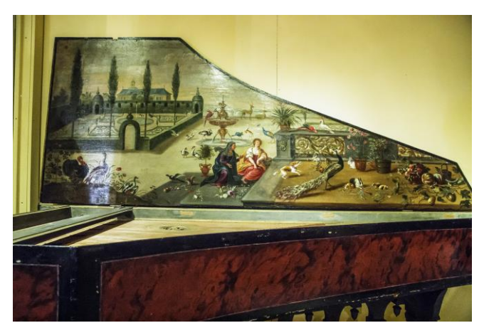
A harpsichord in the NMC collection