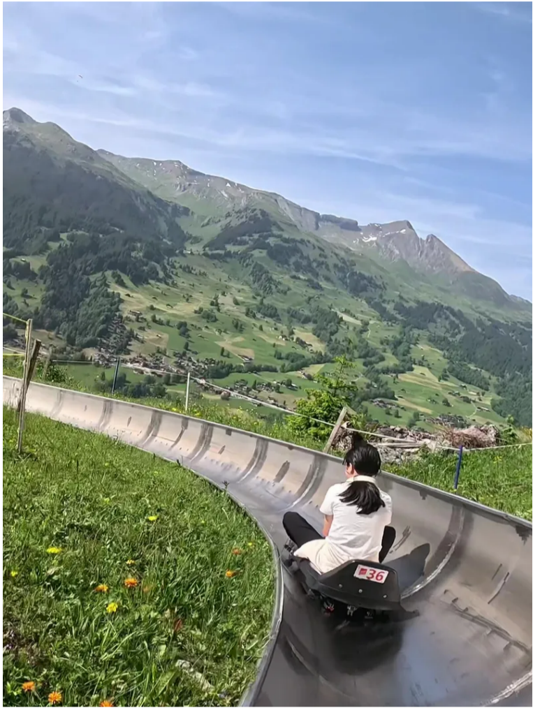
Photo: Pffingstegg Toboggan Run, Grindelwald, Switzerland. (2025)

What keeps people from embarking on a dream vacation, travel adventure, or a journey of self-love and self-discovery? From time to time, we meet individuals who postpone traveling until they have retired or have fulfilled all obligations they think should take priority. Some bring up the issue of the inability to plan complex vacation itineraries. Whatever the reason is, it all boils down to one truth - missed opportunities for personal growth, relaxation, and cultural awareness! It stymies an individual's need to focus on one's well-being and the inner need to break free from manufactured fear coming from within oneself or from outside. God created the earth, and it is beautiful, but the only way to truly know its magnificence and quietly hear what it wants to reveal is to experience it.