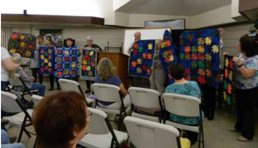
Sundance Group: Maple Leaf Block Swap