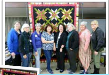
2019 Opportunity Quilt Revealed by the Sundance Kids Neighborhood Group