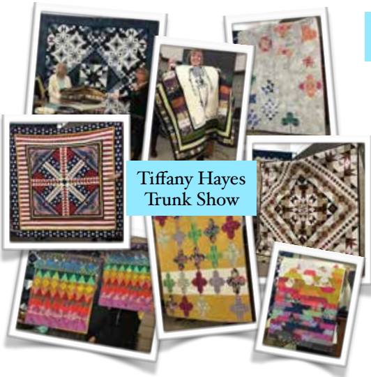
Tiffany Hayes Trunk Show