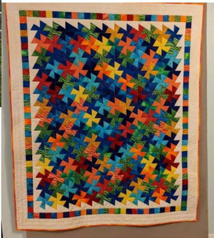
Romany Bowers (below) "Twister"