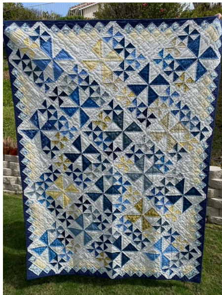
Suzie Owen (above)