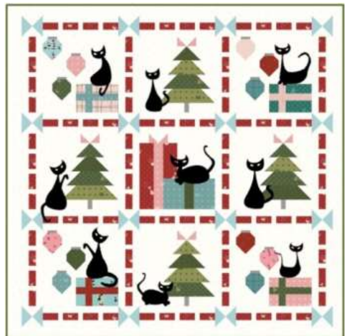
Mod Christmas Quilt pattern by JediCraftGirl on Etsy.com using Mod Meow cat panel by Riley Blake Designs.

Meets every other Thursday at 9:30am (11/3, 11/17, 12/1 etc.) in the clubhouse at Citrus Gardens Mobile Home Park, 1730 Toyon Glen, Escondido, CA. 92026