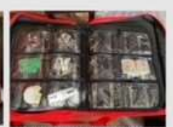
Multiple feet options and bobbins